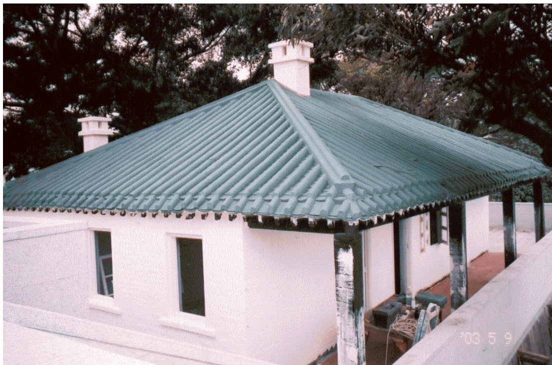
New Block and Toilet Block