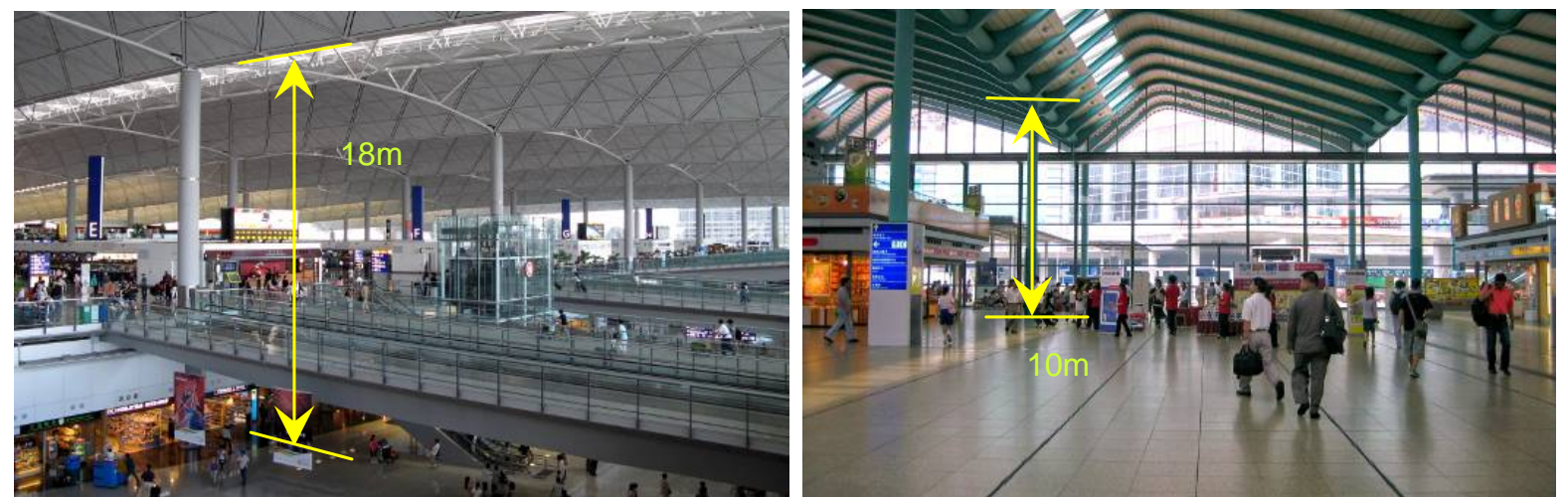
Hong Kong International Airport Lobby