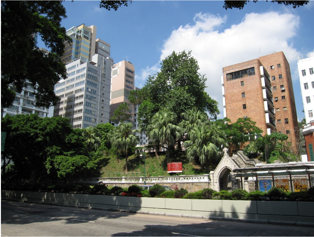
General View of the Church Compound from Nathan Road