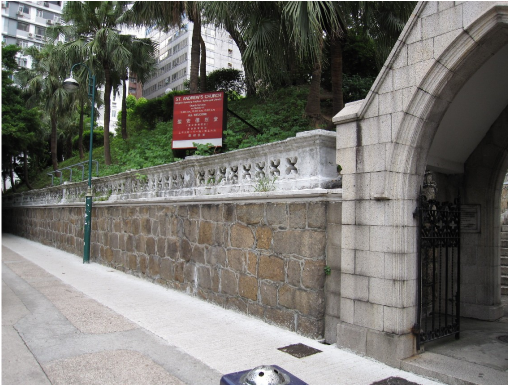
Rubble Wall, Decorative Parapet and Stone Gateway