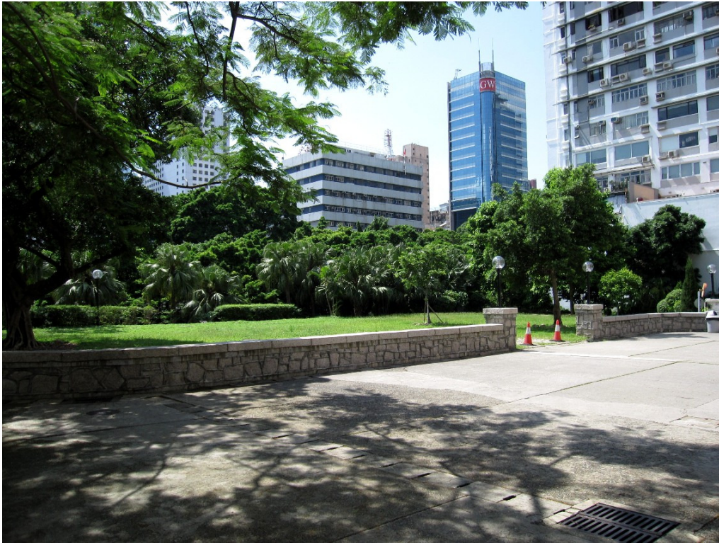
Landscaped Courtyard in front of the Church