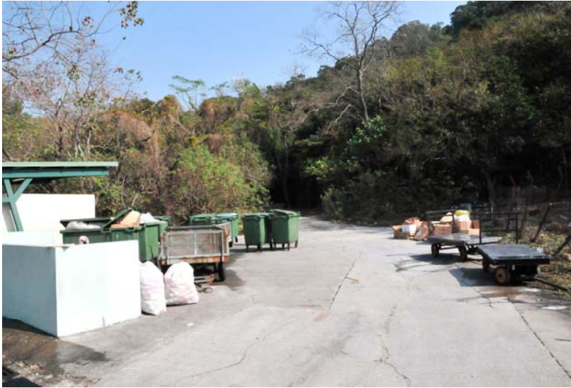
Photo 3: Refuse collection point at the footpath leading to the Rock Carving site