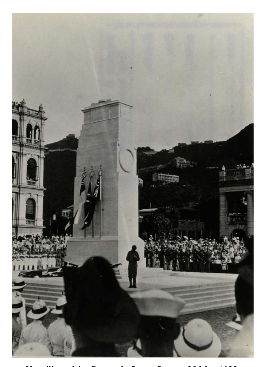
Unveiling of the Cenotaph, Statue Square, 25 May 1923