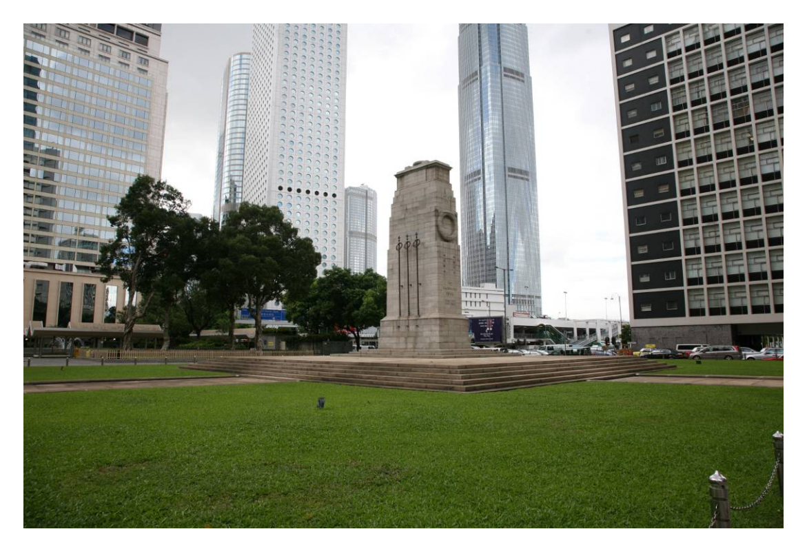
Present view of the Cenotaph