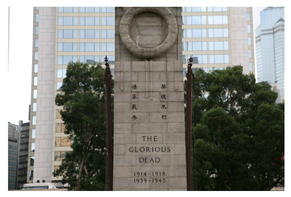
Eight Chinese characters "英魂不朽 浩氣長存", meaning "May their martyred souls be immortal, and their noble spirits endure", corresponding to the inscription "The Glorious Dead" were carved on the side of the Cenotaph in 1981