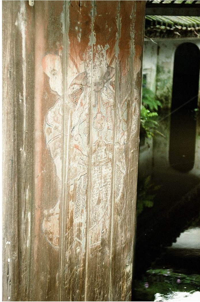
The carved door god on the main entrance door