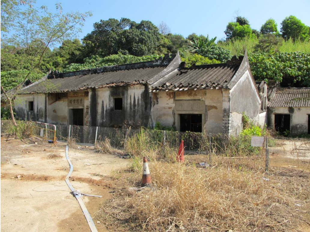
Exterior of the building