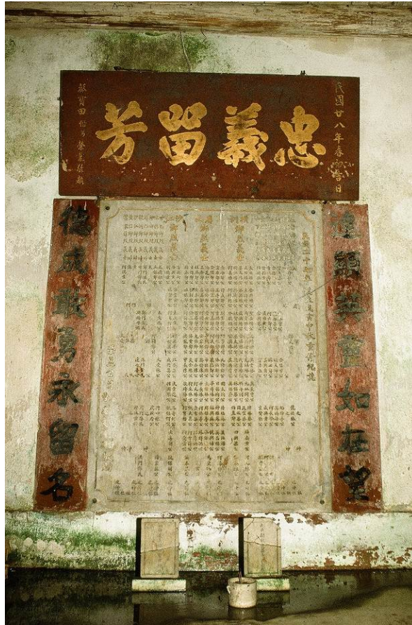
The memorial plaques inside the Communal Hall have been salvaged by AMO