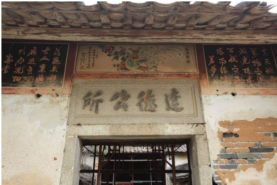
The granite name plaque and murals at the main entrance are still intact