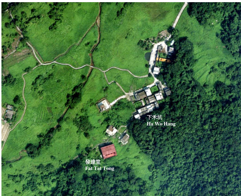
Aerial view showing Fat Tat Tong (shaded red) and its surrounding area