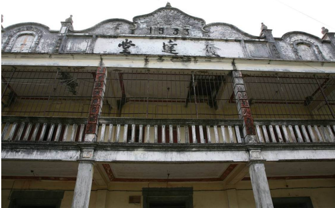
Name of Fat Tat Tong and its construction year marked on the pediment above the front verandah