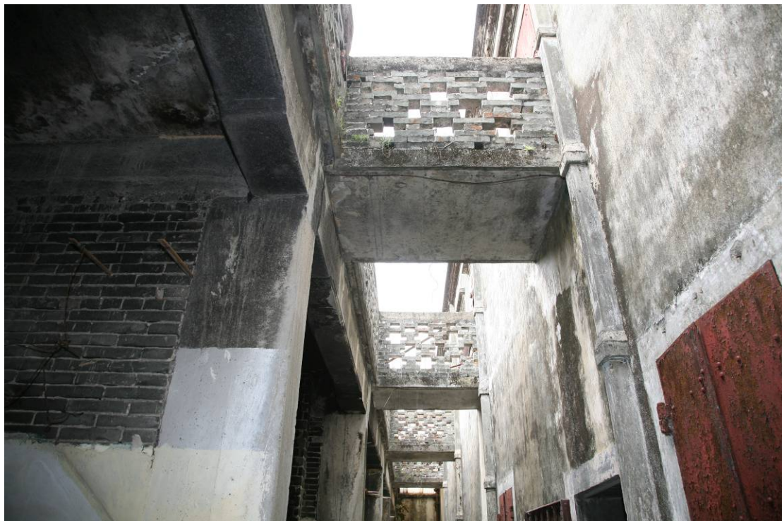
The brick bridges connecting the upper floor of the main building with the roof terraces of the rear outhouses