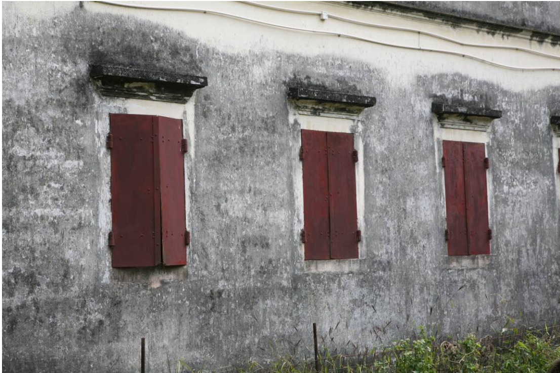
Hooded windows at the flank walls