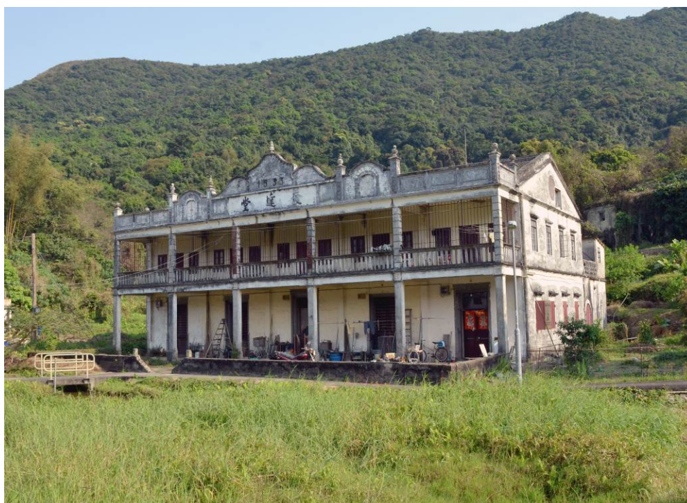
Exterior of Fat Tat Tong