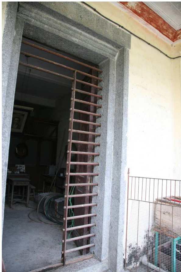
Metal sliding doors at the main entrances