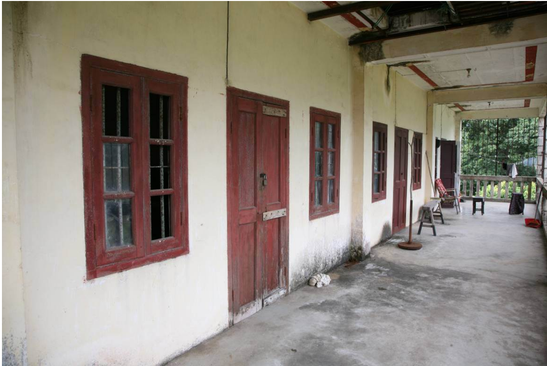
A shared verandah on the upper floor