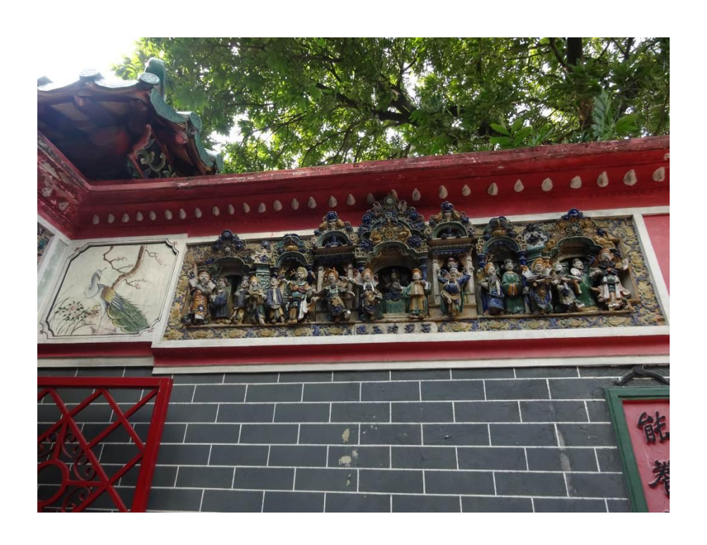
Exquisite Shiwan (石灣) ceramic figurines in the internal courtyard of the side chambers