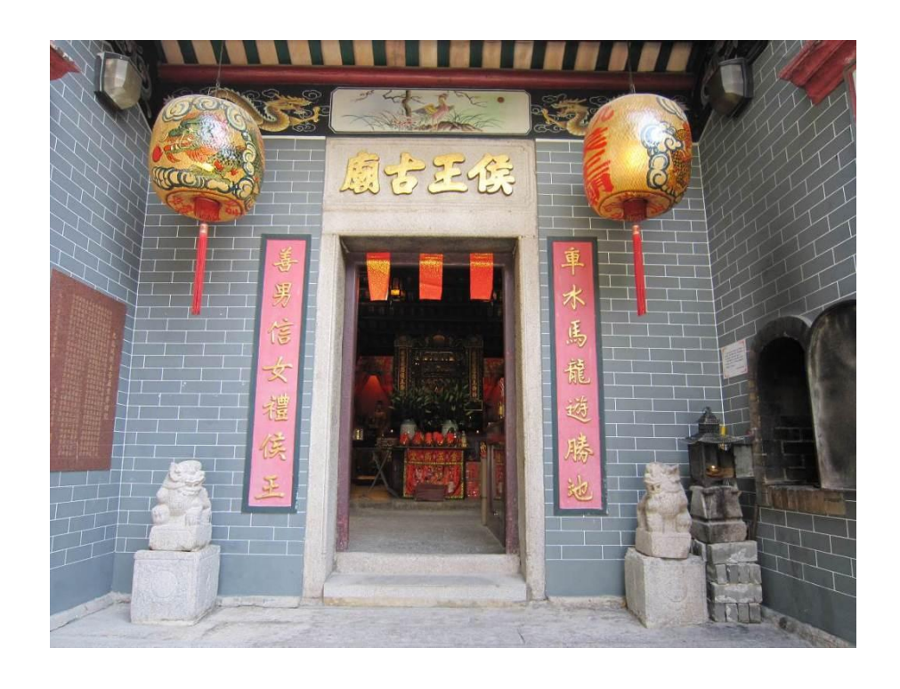
A pair of stone lions in front of the entrance hall dated the 3^{rd} year of Xianfeng (咸豐) reign (1853)