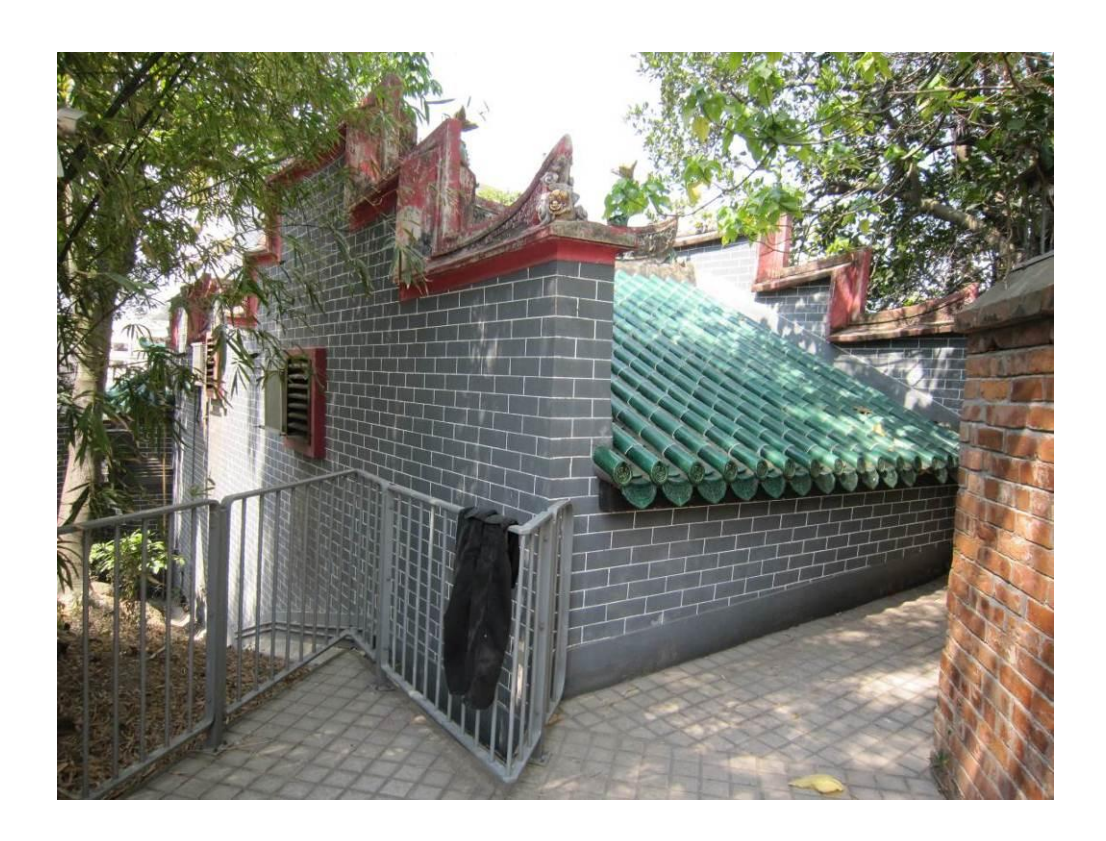
The stepped gables of the rear hall in the style of "五岳朝天" (literally means five peaks paying tribute to heaven)