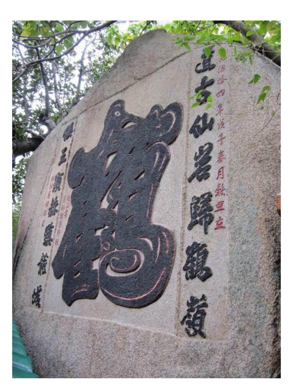
The stone inscription of "鶴" (crane) dated 1888 at the back of the main temple building