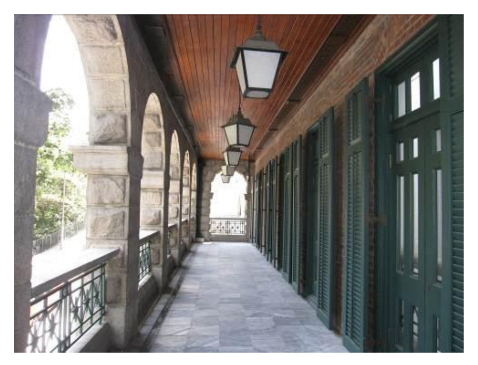
Open verandah, with pendant lights, boarded ceiling and timber shutter doors added during the 2002 renovation.