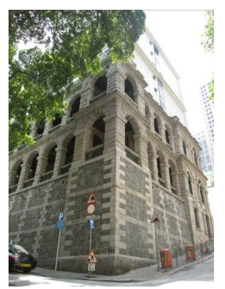
Eastern Street elevation from the corner of High Street.