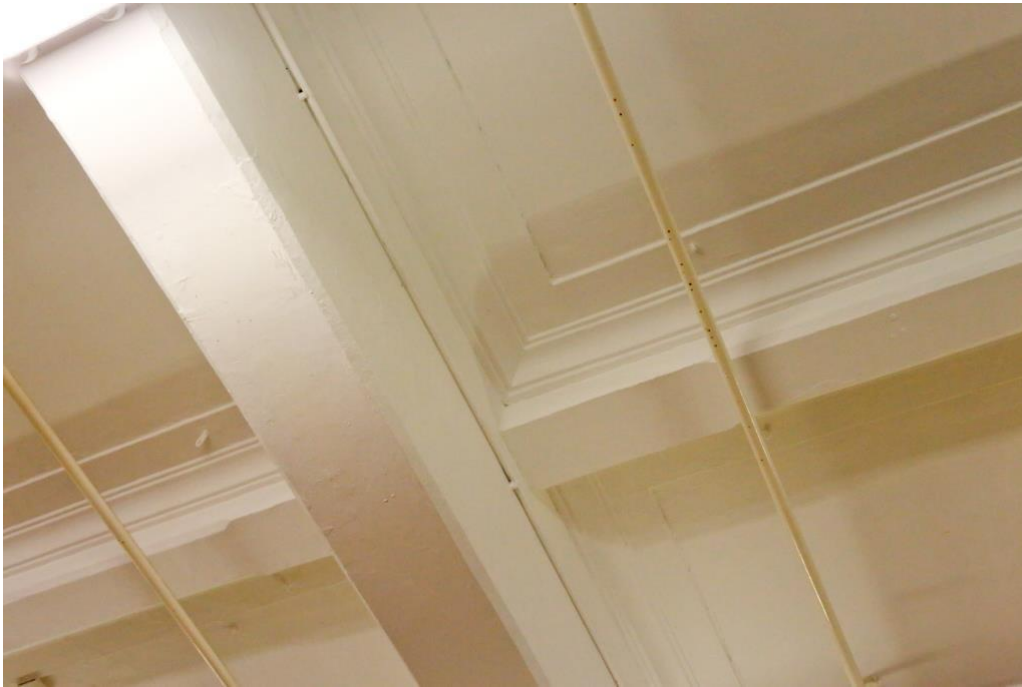
Classical plaster mouldings to the ceiling cornices.