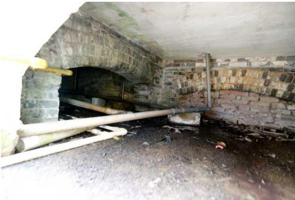
Typical view of the ventilated sub-floor, showing grey brickwork and arched supports to the main ground floor structure above.