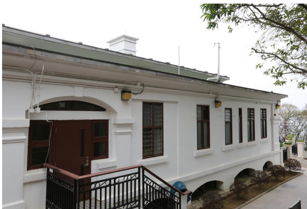
The two-step flat roof converted from the original pitched “Jack-Roof”.