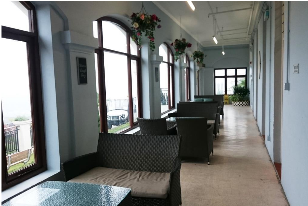
The front verandah with windows installed. Originally the open verandah would have been a common sitting-out area for the tenants.