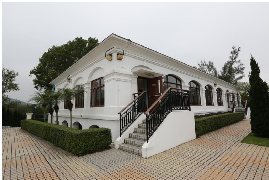
The north and east facades, originally surrounded by wide verandahs set on low segmental arches.