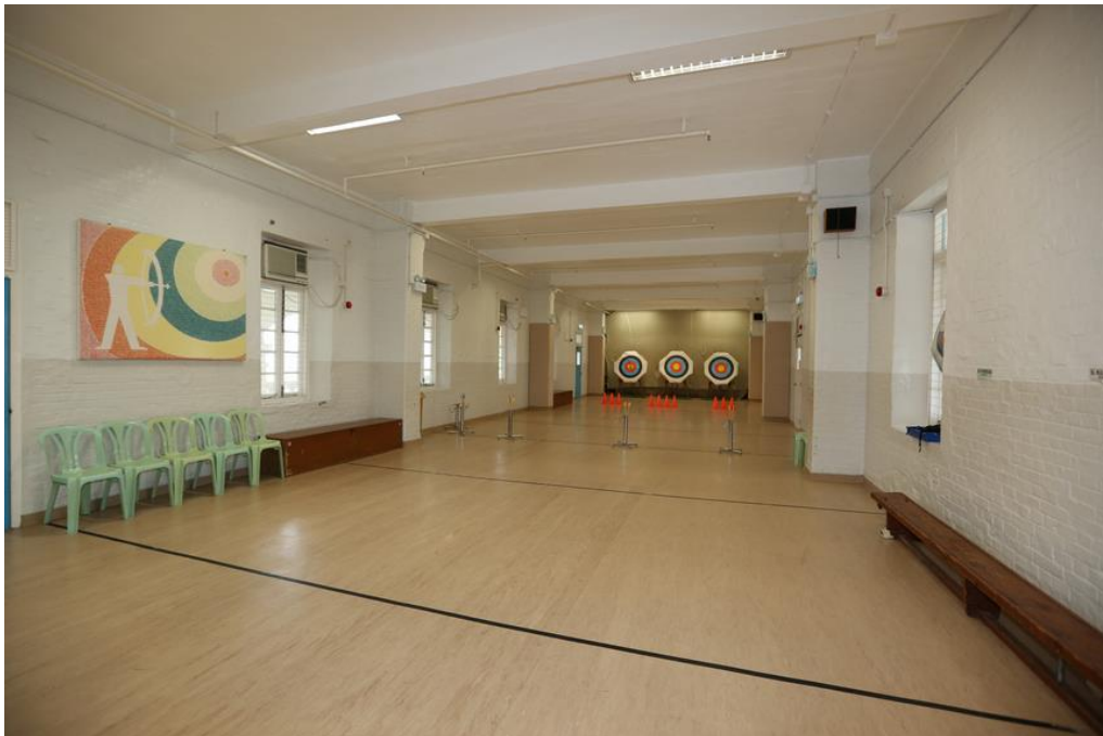
The large barrack room on the second floor, originally used for junior soldiers' accommodation.