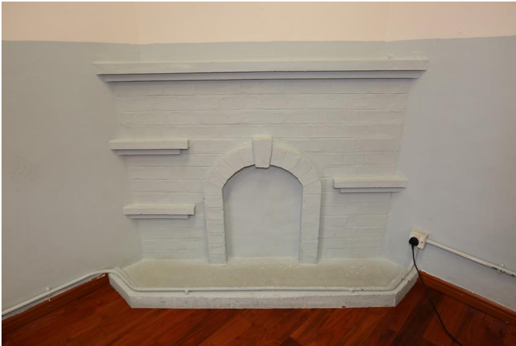
A brick fireplace on the ground floor.