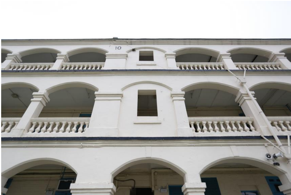
Junction of the older block (right of photo) and the 1935 extension (left of photo).