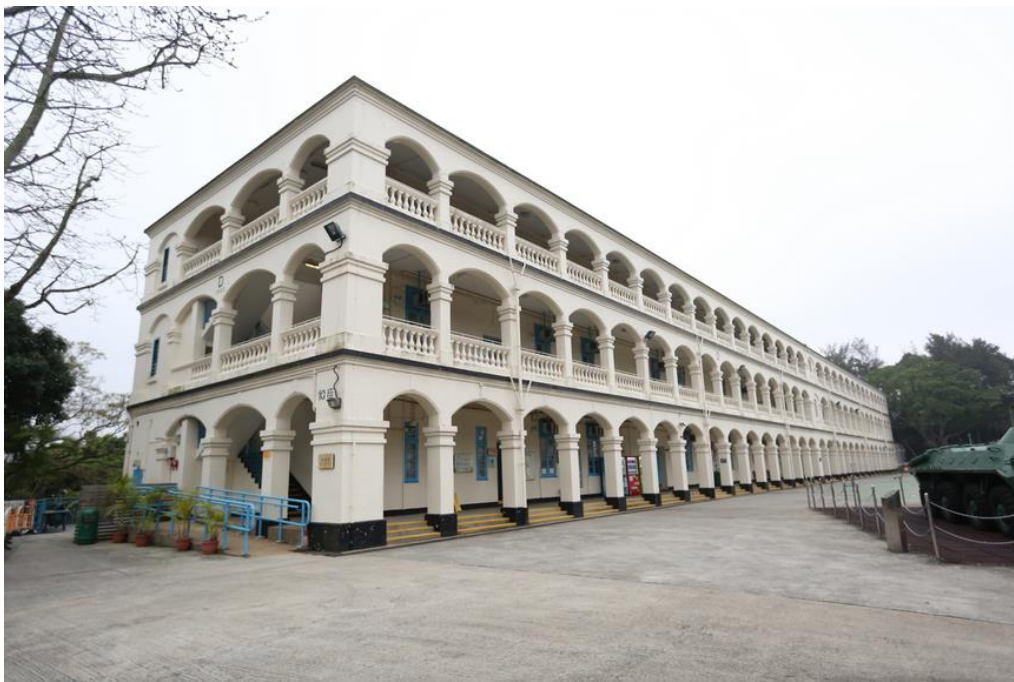
The east facade featuring the long open arched, colonnaded and balustraded verandahs.