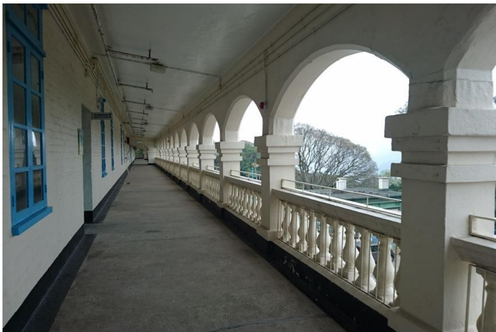
Tuscan-style columns, Classical urn-shaped balustrades and granite coping stones of the verandah.