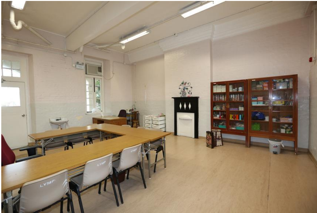
A room on the ground floor, once used as the armoury.