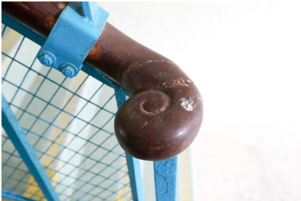
The handrail scroll of an internal staircase.