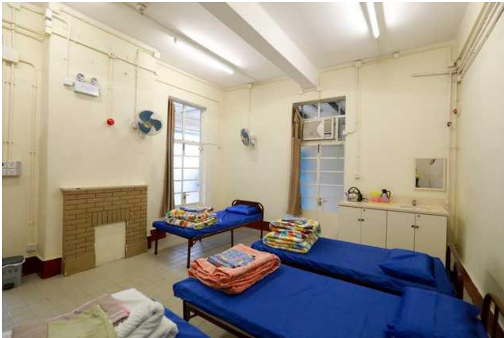
Former officers bed-sitting room, now used as a family accommodation unit.