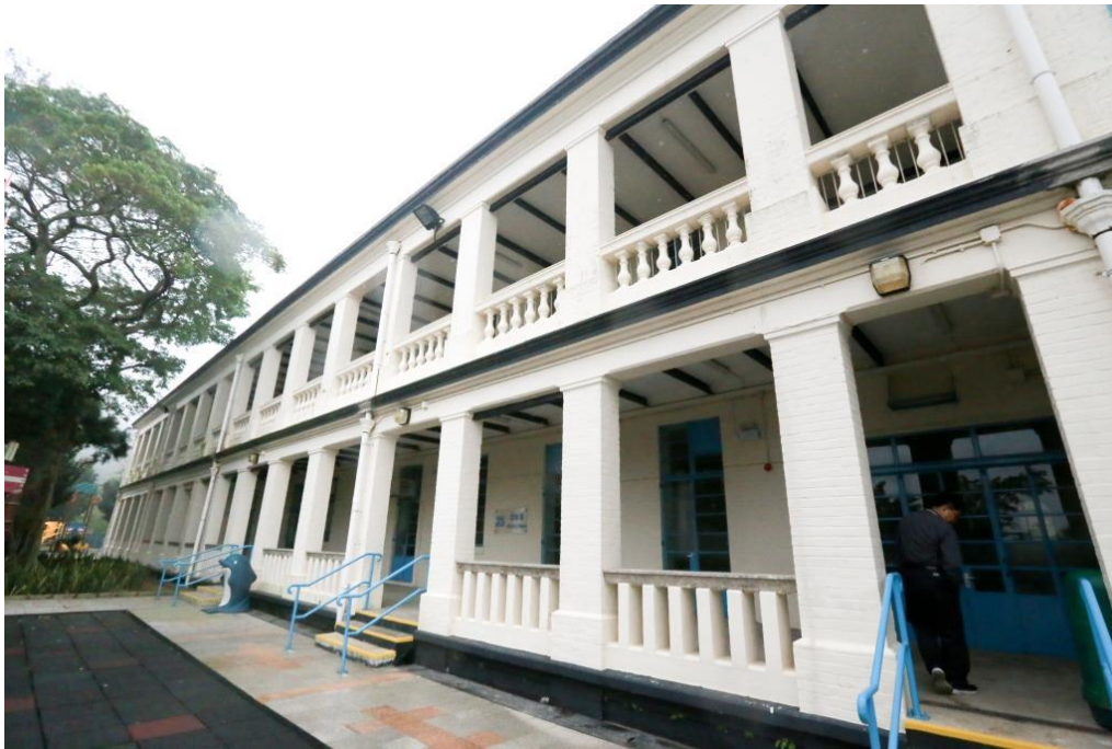
East facade with open colonnaded and balustraded verandahs supported by square brick columns with simple bases and capitals.