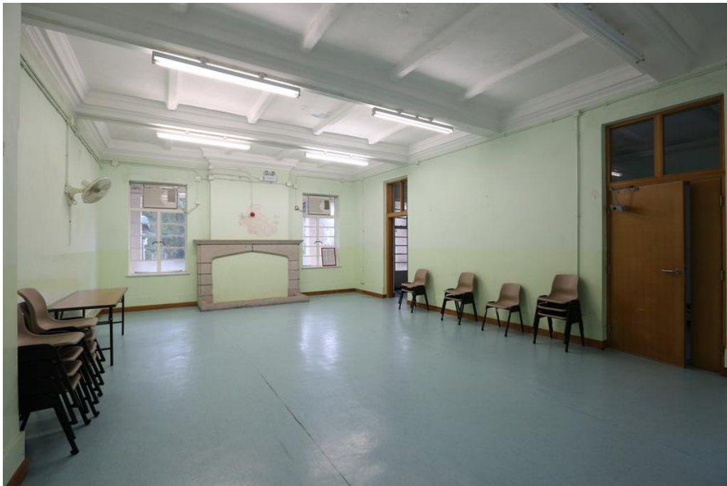
The old dining room on the ground floor and the original granite fireplace