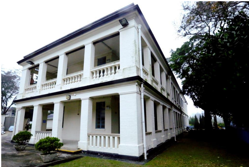
The south facade, of the same design as the east, with urn-shaped classical balustrating on the first floor verandahs.