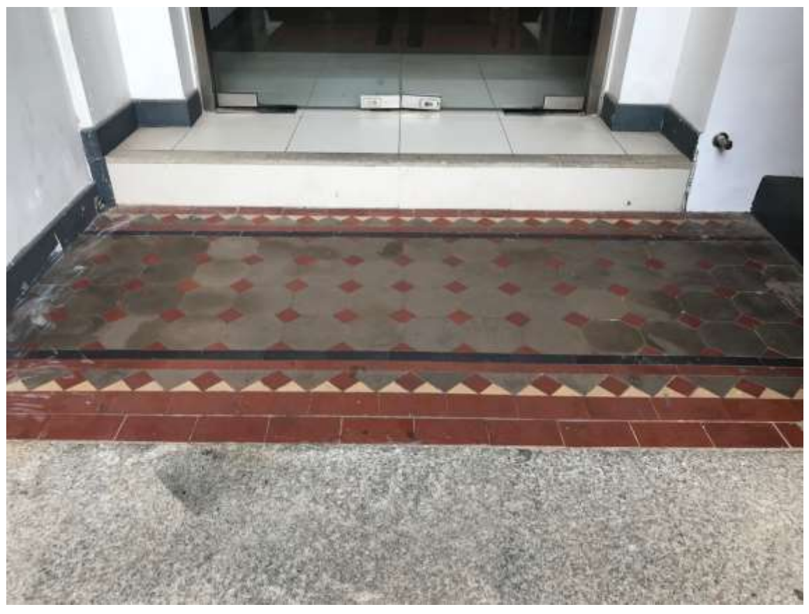
Historic patterned floor tiles at the verandah in the north elevation