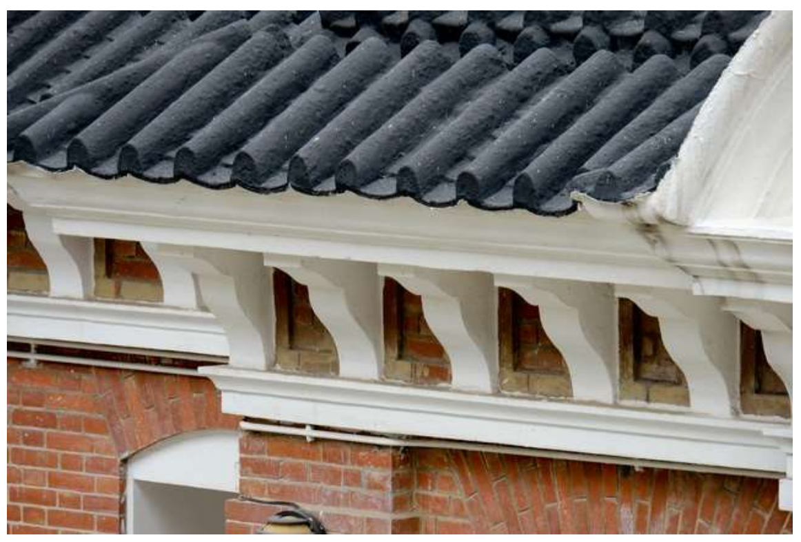
The roof eaves with numerous supporting brackets as a design feature, and a moulded cornice underneath