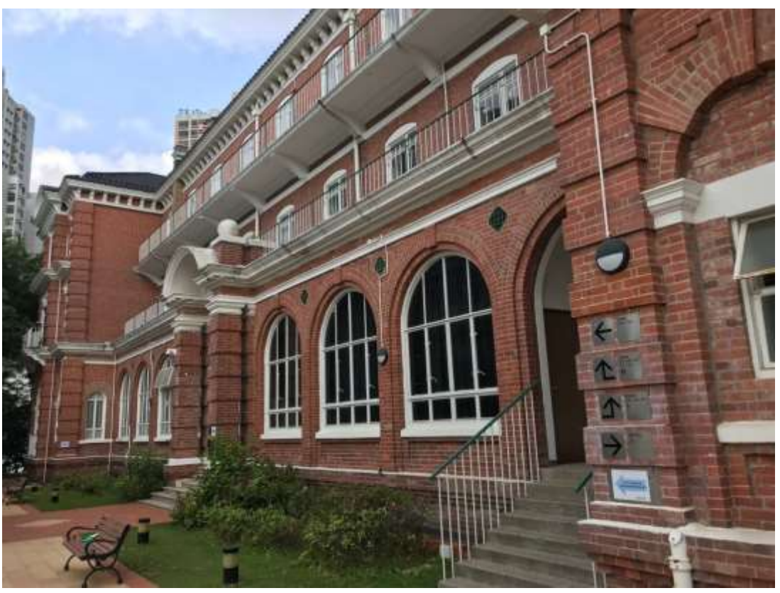
Eliot Hall, The University of Hong Kong, Pokfulam, Hong Kong