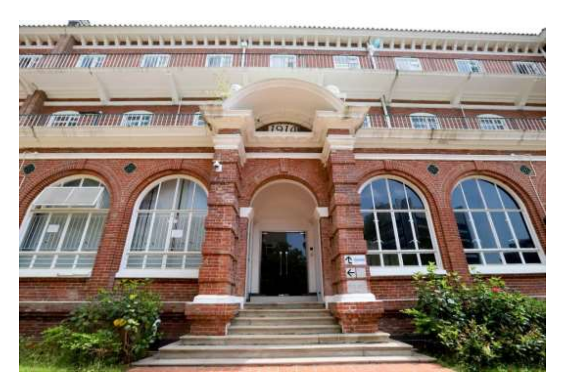
Rusticated brick piers and an elaborate shaped portico at the front façade