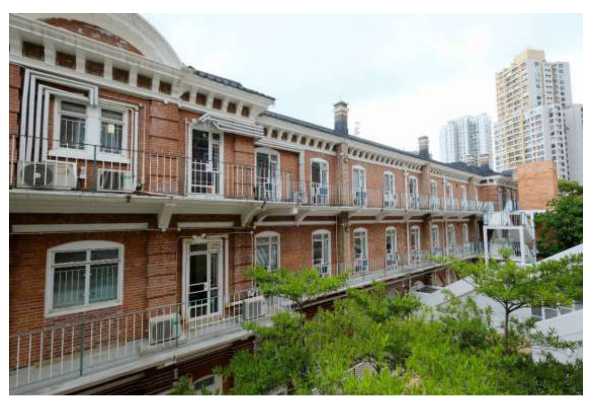
Rear elevation facing May Hall