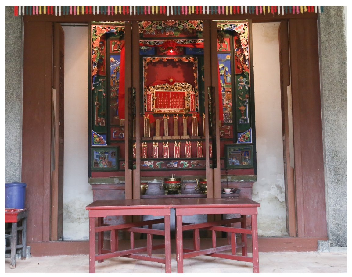
Exquisitely carved timber ancestral shrine in the rear hall