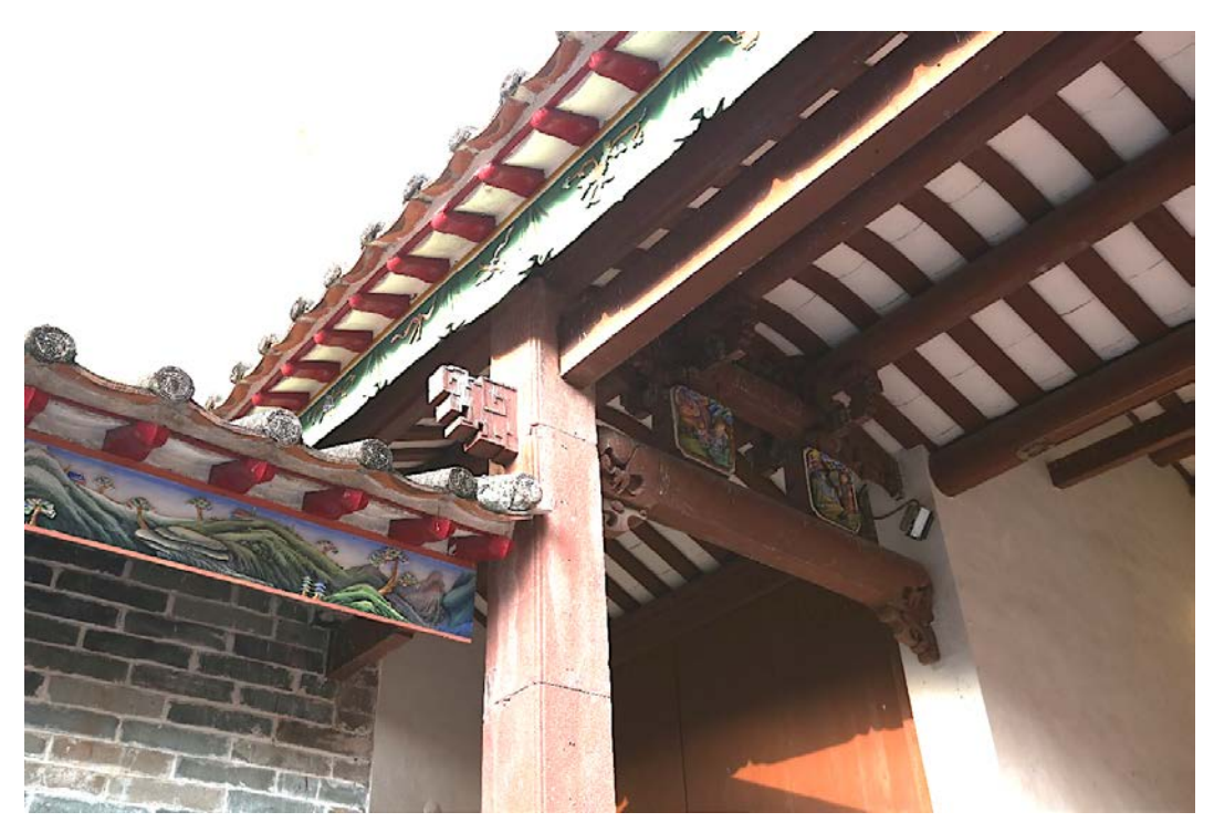
The red sandstone internal eaves column and ornately carved timber beams and camel's humps of the entrance hall