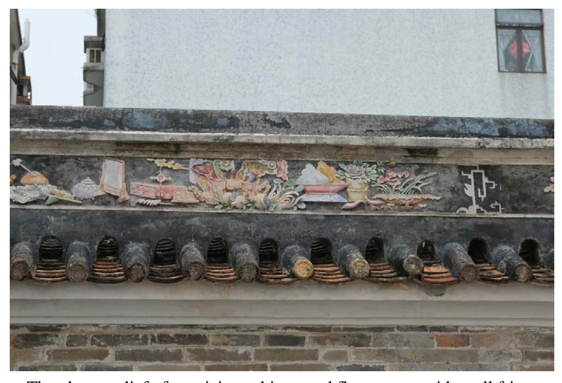
The plaster relief of auspicious objects and flowers on a side wall frieze