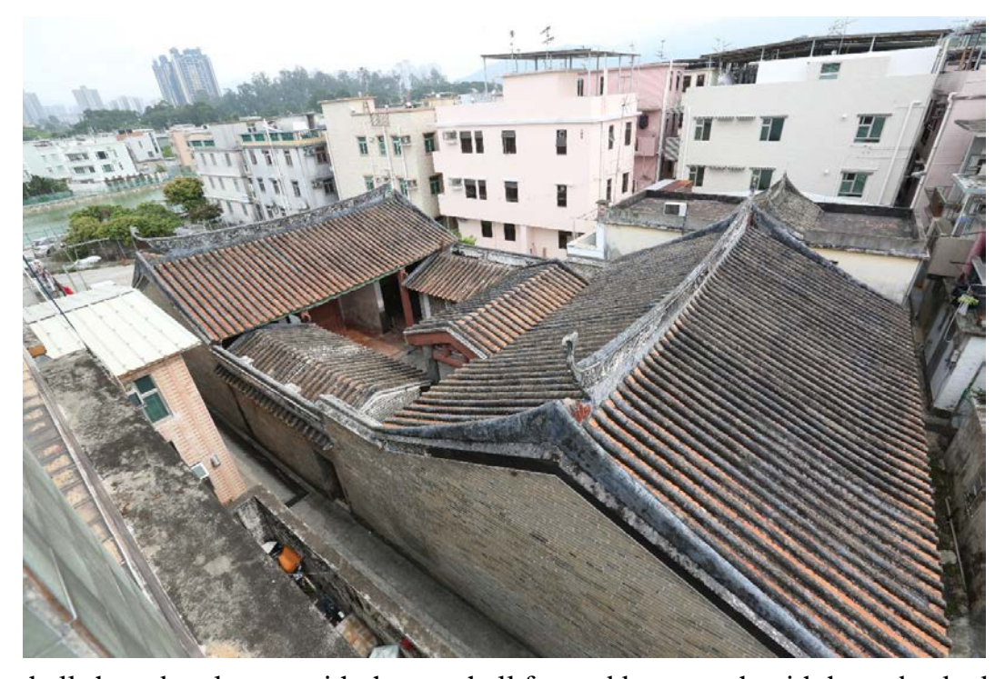
Two-hall-three-bay layout with the rear hall fronted by a porch with humpbacked roof