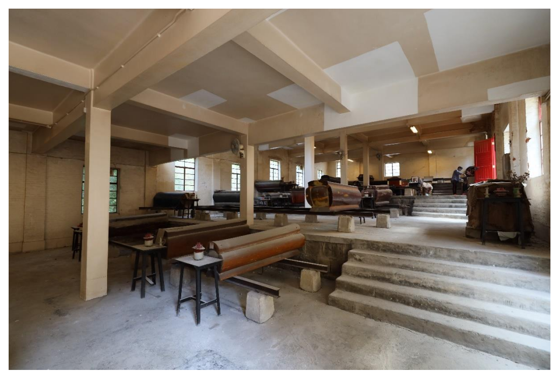
Interior of the New Hall. It is a flat concrete roofed building supported by rectangular columns.