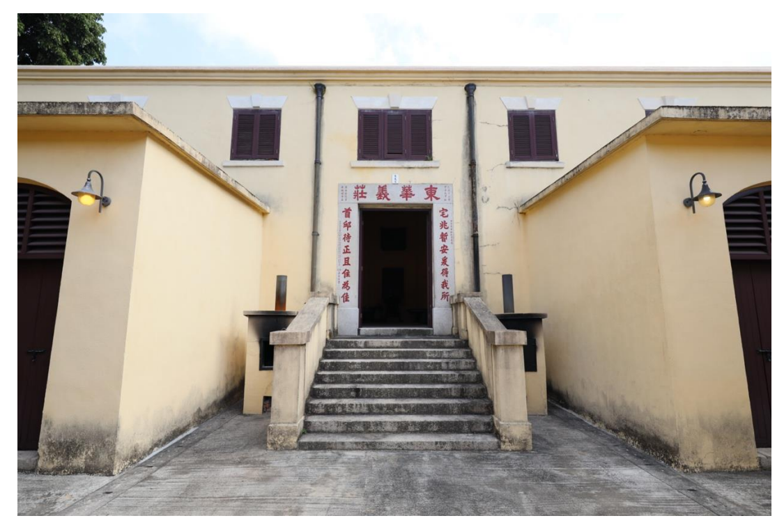
The entrance of the Old Hall is decorated with a granite door frame inscribed with the name "Tung Wah Coffin Home" in Chinese and a pair of couplets dated 1924.