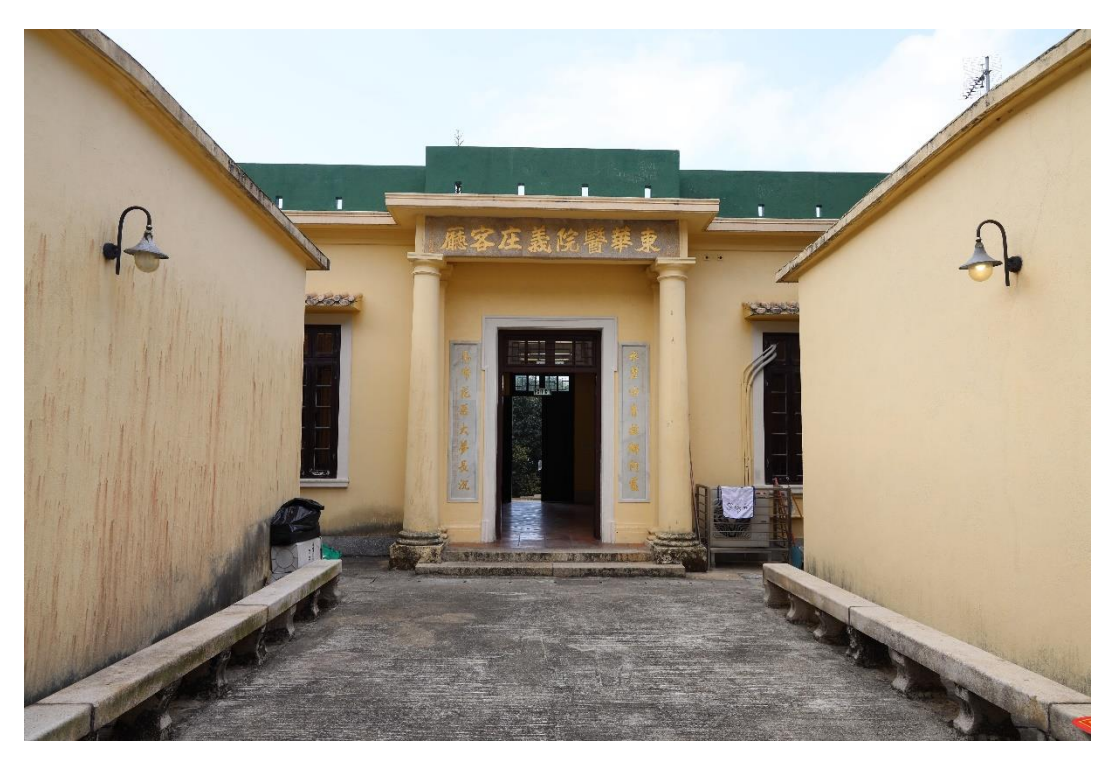
Rear elevation of the Reception Hall. A portico is supported by a pair of Tuscan columns and pilasters.