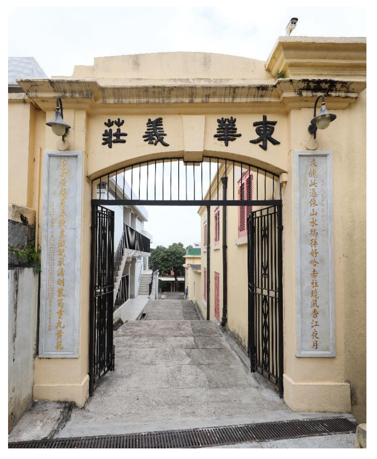
A Western-style segmental pai fong (牌坊) at the coffin home. The structure is topped by a cornice with a slightly curved pediment above. The name "Tung Wah Coffin Home" is moulded in relief in Chinese to either side of the keystone.