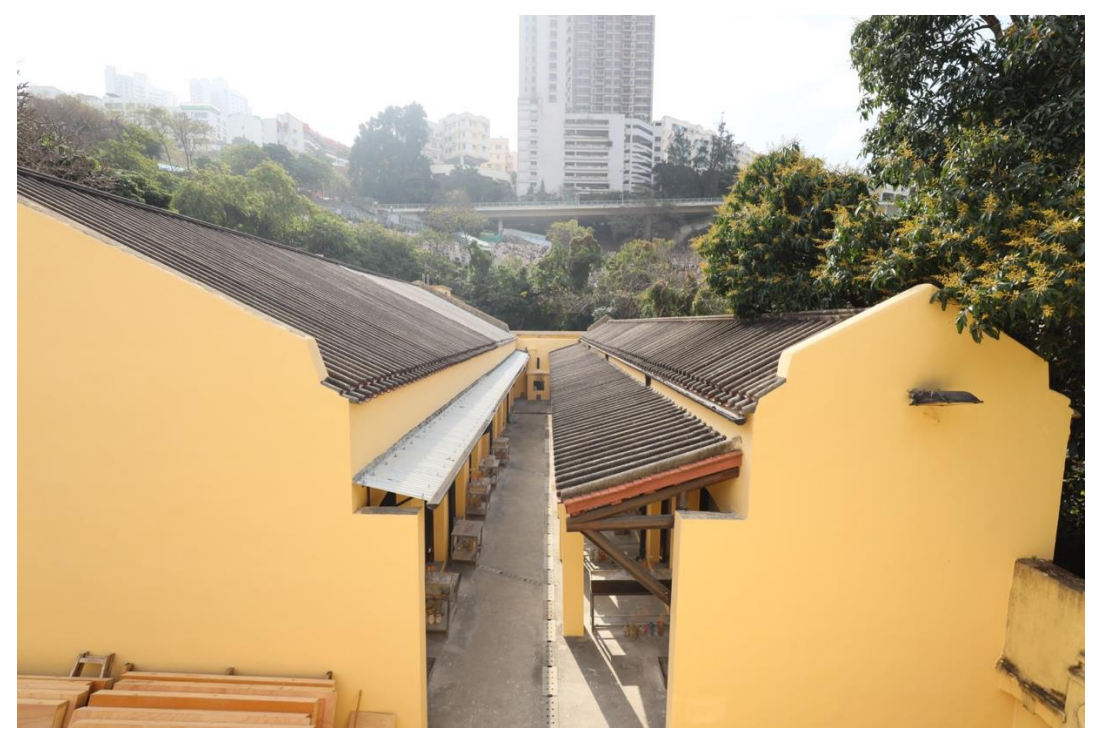
The coffin rooms "Hong" (left) and "Ning" (right) were built with pitched roofs laid with double pan and roll tiles.