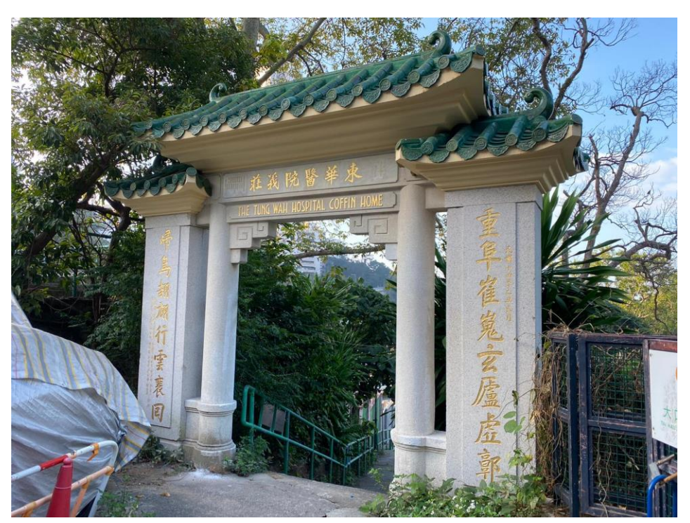
The coffin home's Chinese-style ceremonial pai lau (牌樓) near Victoria Road. It was built of granite and has a granolithic finish with green-glazed tiled roofs decorated with ridge-end ornaments and moulded cornices.