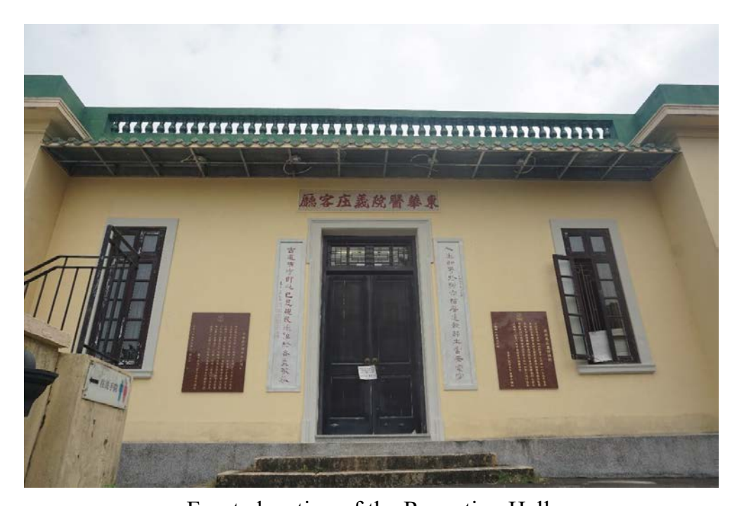
Front elevation of the Reception Hall. The parapet on the concrete flat roof is decorated with vase-shaped balusters.