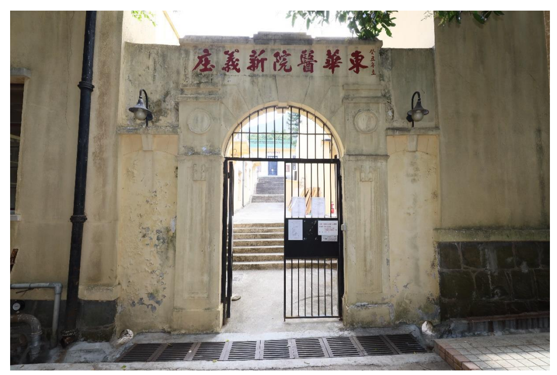
The western entrance of the coffin home built in 1913. The central bay is decorated with moulded voussoirs, a keystone and a pair of ornamental pilasters.