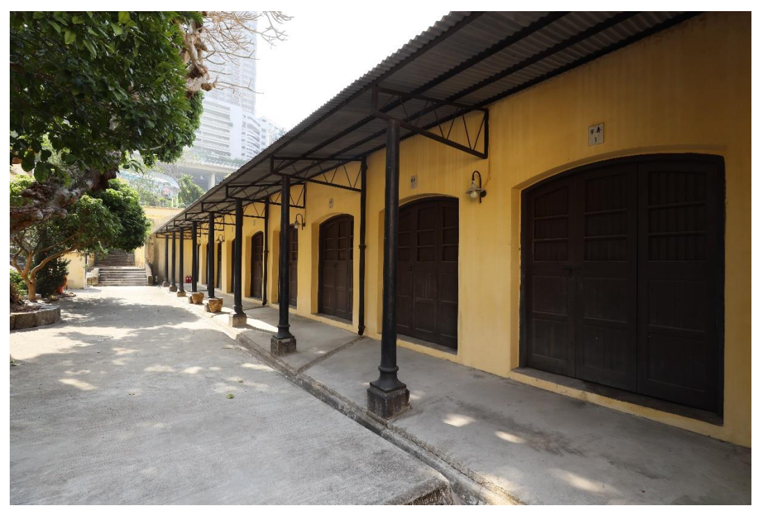
The verandah in front of the "Sau" coffin room supported by iron columns and brackets.