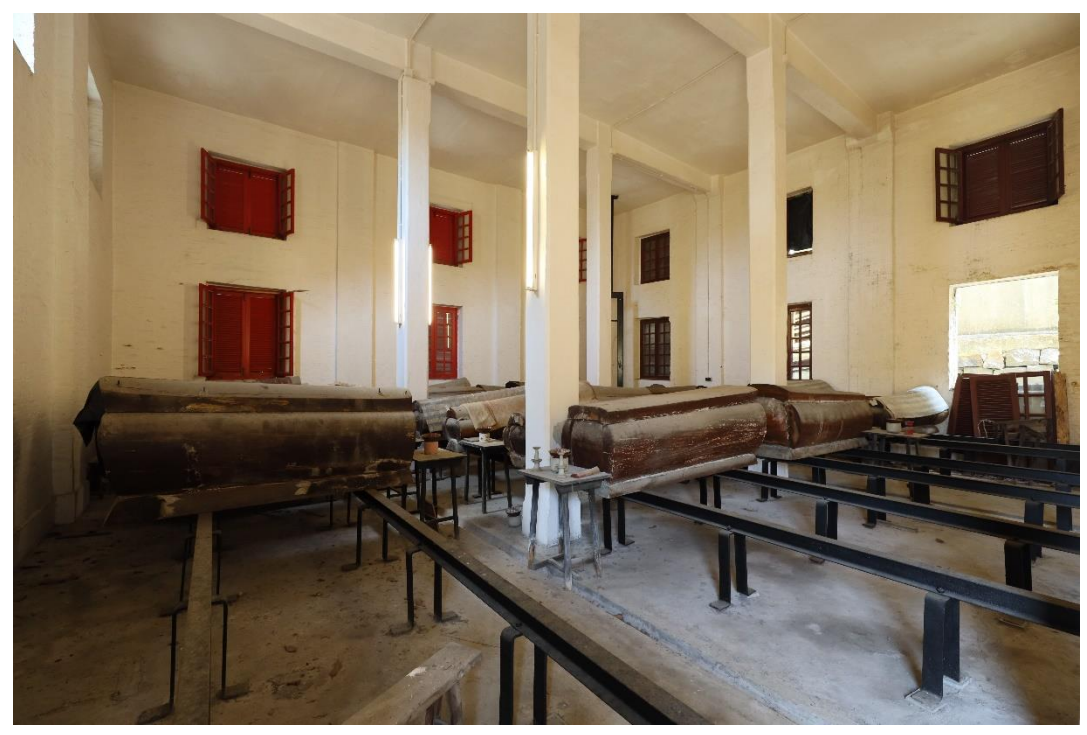
Interior of the Old Hall. It was originally a double-volume hall with a mid-height interior gallery, which has now been removed.