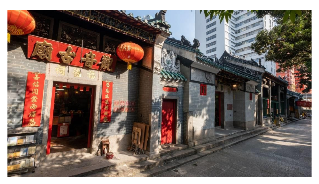
The five temple buildings, i.e. Tin Hau Temple, Kung Sor (公所), Fook Tak Tsz (福德祠) and two Shu Yuen (書院), were built between 1876 and 1920.