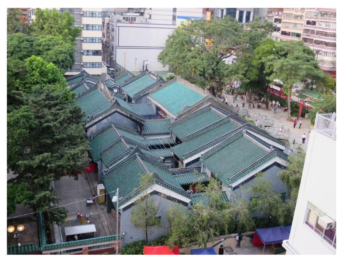
Bird's eye view of the Temple compound.