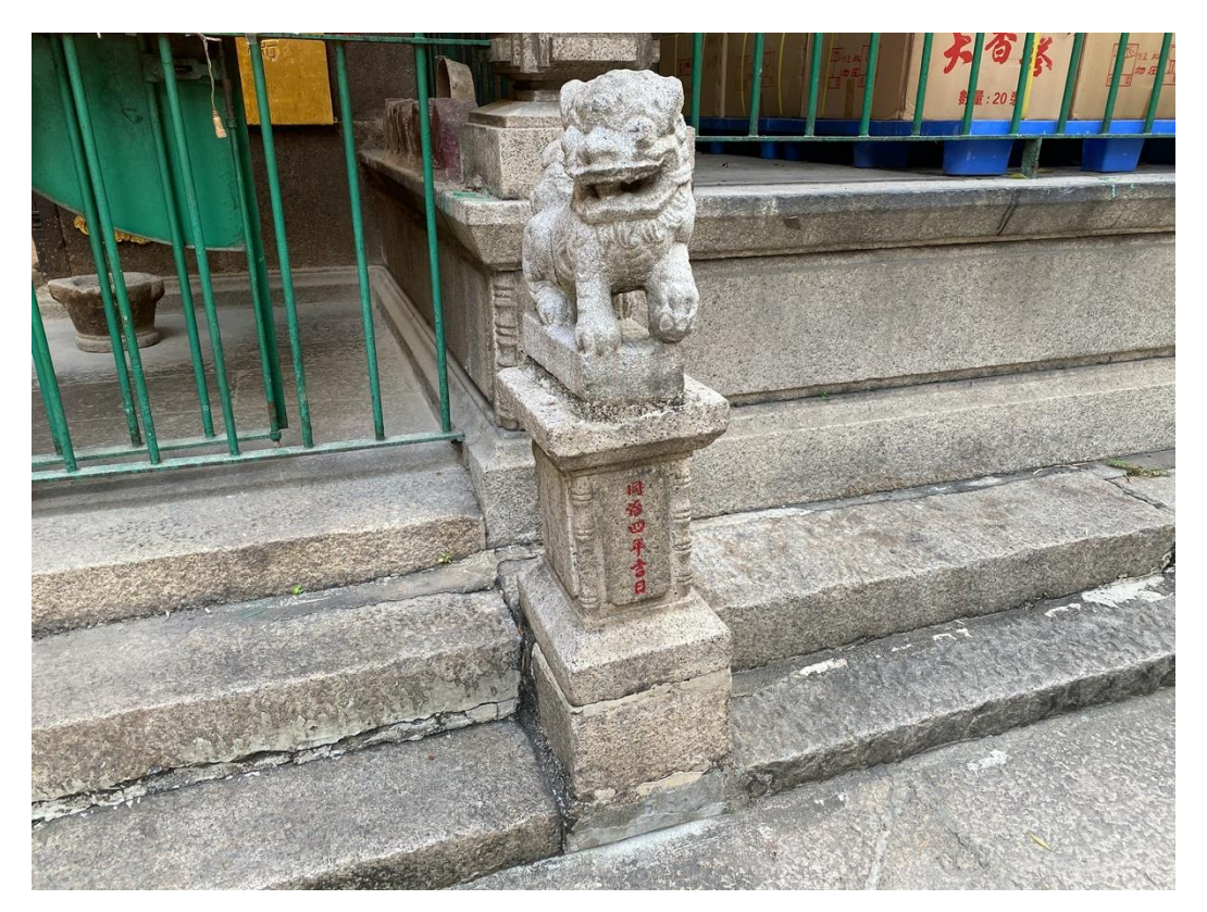
Inscriptions on the stone lion in front of Tin Hau Temple, marking the 4<sup>th</sup> year of Tongzhi (同治) reign (1865) of the Qing dynasty.