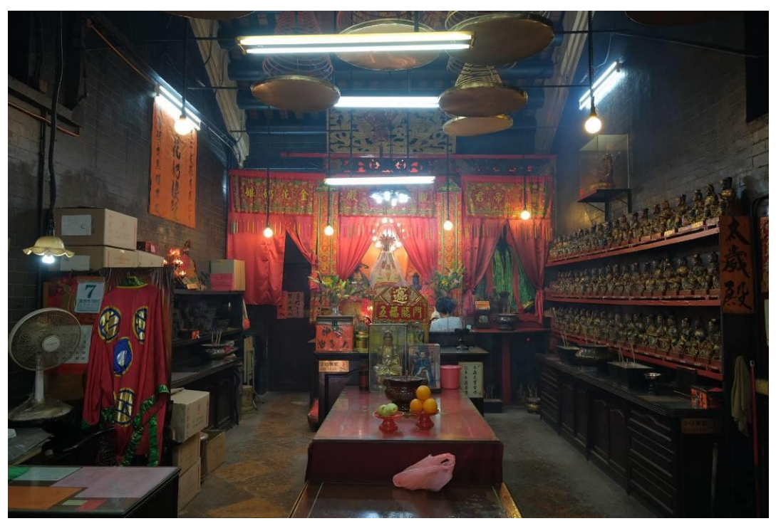
Interior of Fook Tak Tsz. Kwan Yam, Kwan Tai and Lady Kam Fa are enshrined in the main altars.

Interior of Kung Sor (now Kwun Yam Lau She Tan 觀音樓社壇). A shrine for God of Soil and Grain (社稷之神) is located in the middle of the open courtyard and the altar for Kwun Yam is at the central bay of the rear hall.