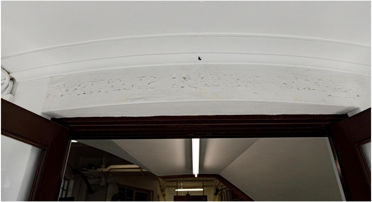
The trace of the name “Northcote Training College” at the main entrance on the south elevation of the main building