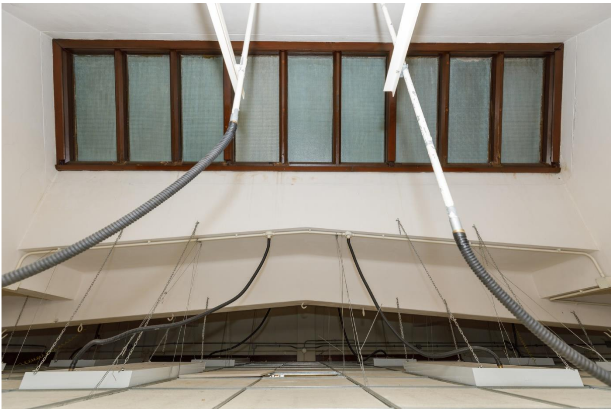
Pitched beams and the undersides of the blocked skylights made up of timber frames and glass panes could be found above the false ceiling in the Art Room on the second floor