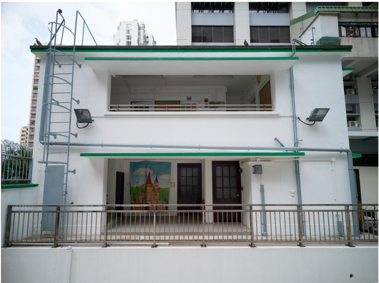
The two-storey former caretaker's quarters situated near the entrance gate on Eastern Street