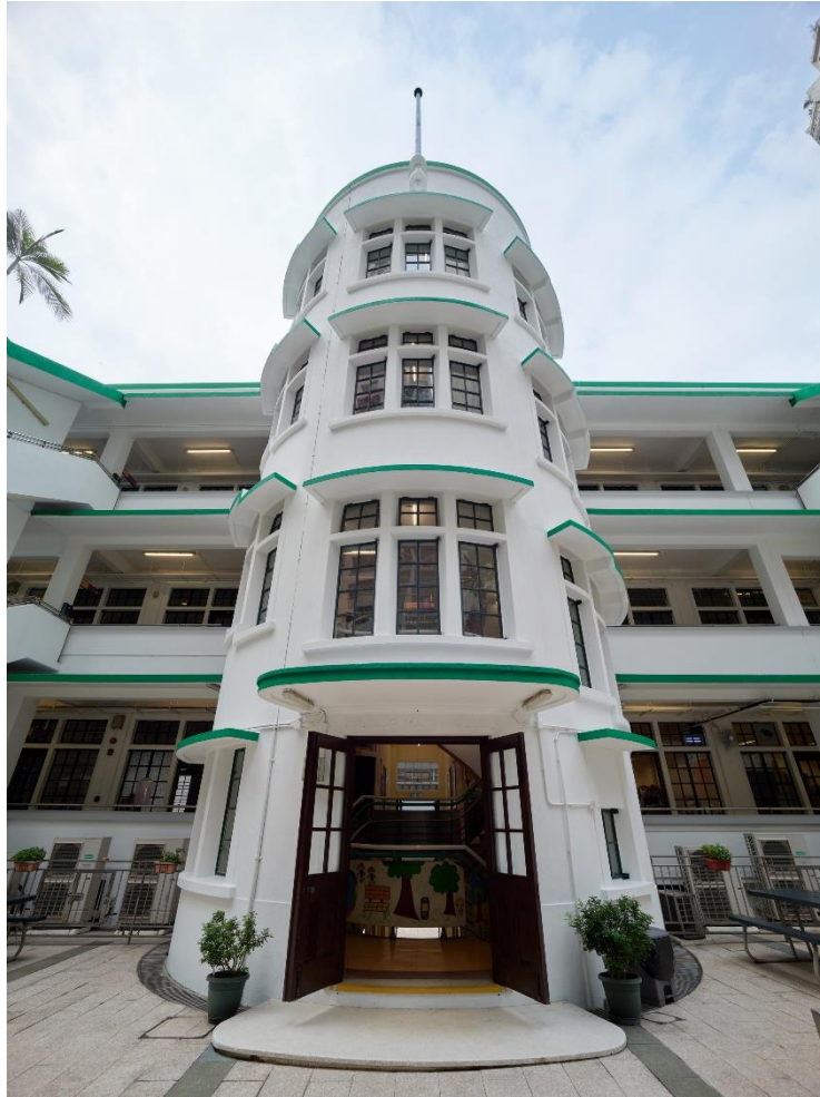
The central staircase with a curved façade and a flagpole positioned centrally at the roof level