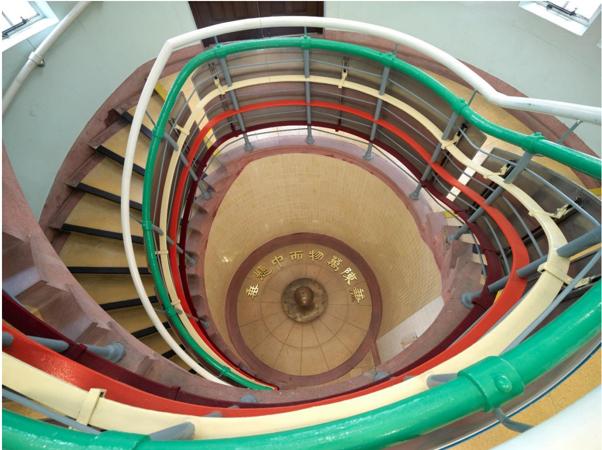
The central spiral staircase with terrazzo finishes