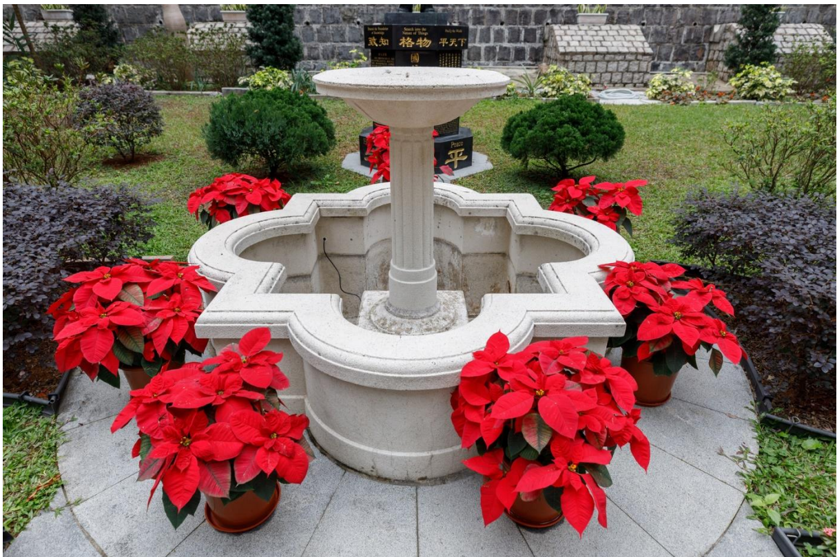
The fountain built of granite in front of the main building