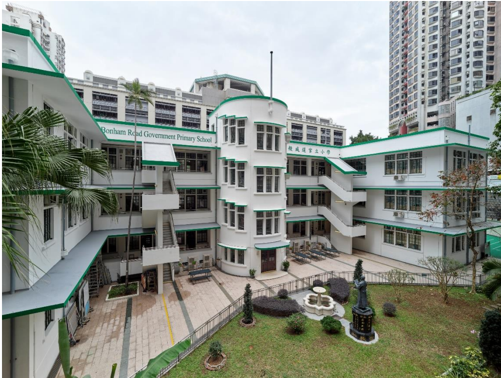
The main façade of Bonham Road Government Primary School facing Bonham Road with both Chinese and English names on the parapet