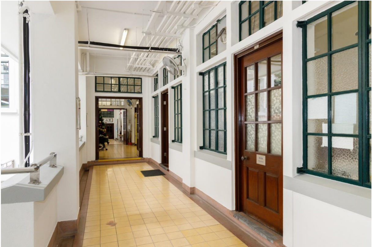
The timber doors, steel-framed windows with patterned or plain glass panes, and the old-styled ironmongery are all well maintained