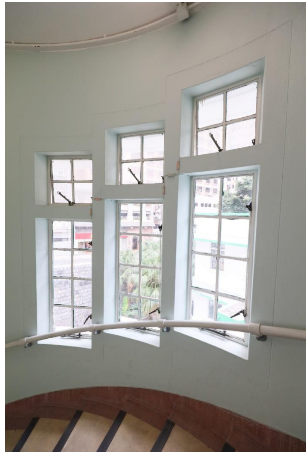
Windows rising progressively up the stairs enhances the aesthetics of the main building