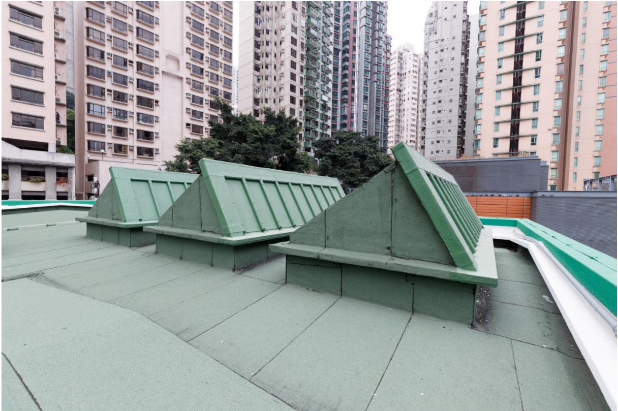
The three skylights on the roof have been blocked