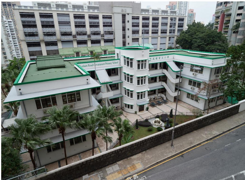
Bird's eye view of the main building of Bonham Road Government Primary School, showing its E-shaped plan comprising a long centre portion and a wing on each end