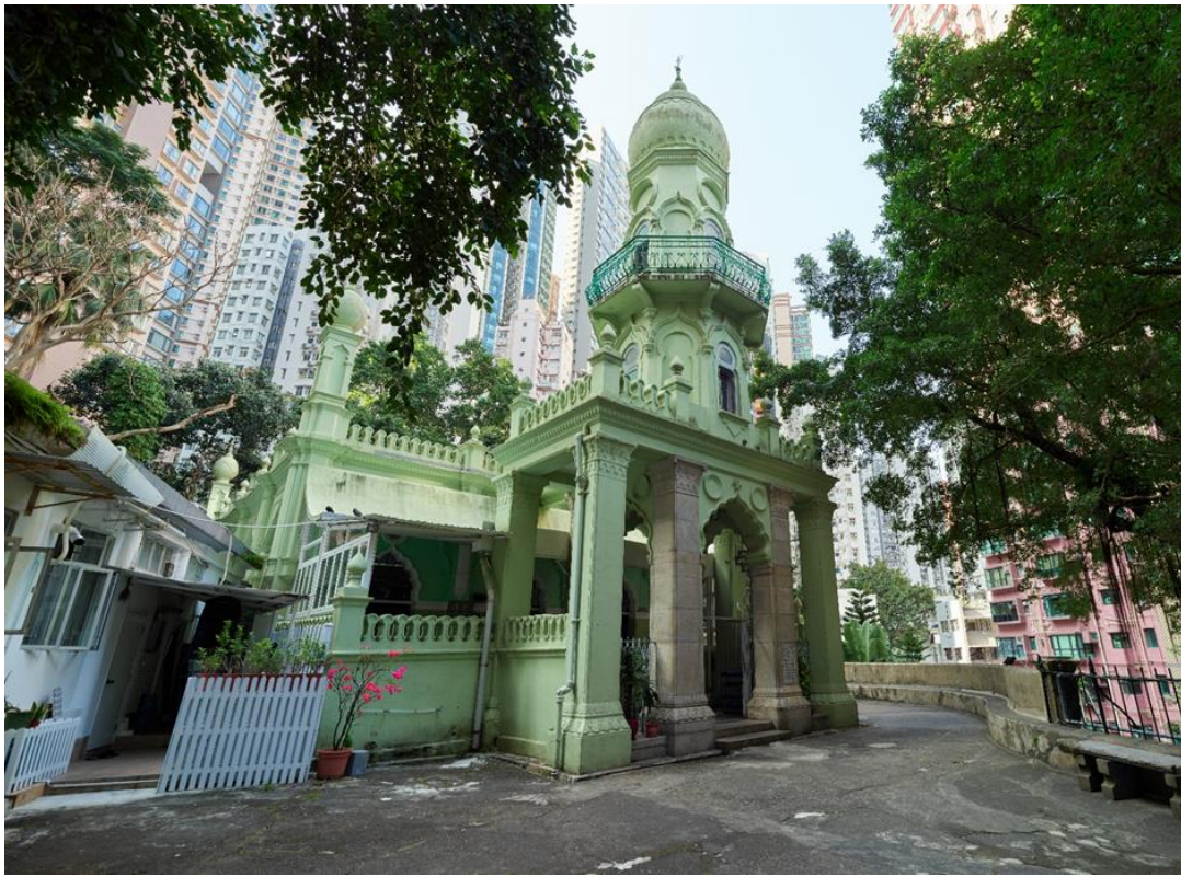
The front façade of Jamia Mosque. The minaret with balcony is the most prominent feature of the Jamia Mosque.