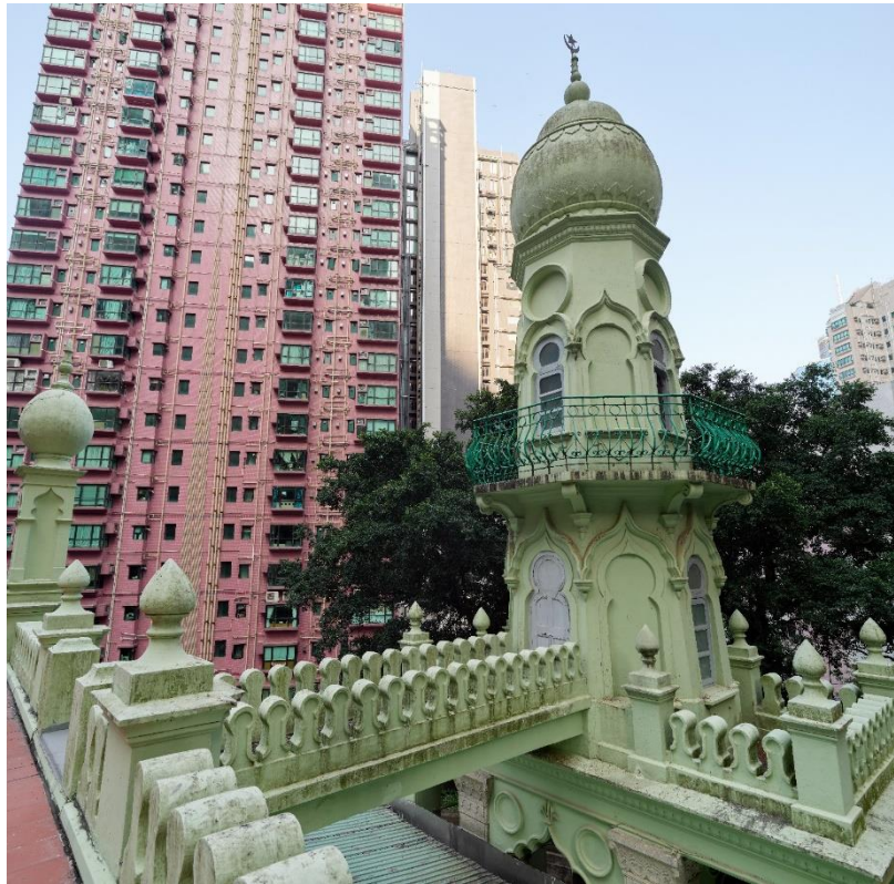
Crescent and star at the top of the dome of minaret. A connecting bridge linking the minaret and the roof of the prayer hall.