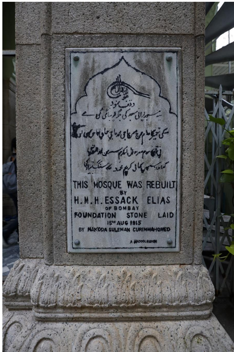
Foundation stone of Jamia Mosque embedded in the granite column of the entrance portico.