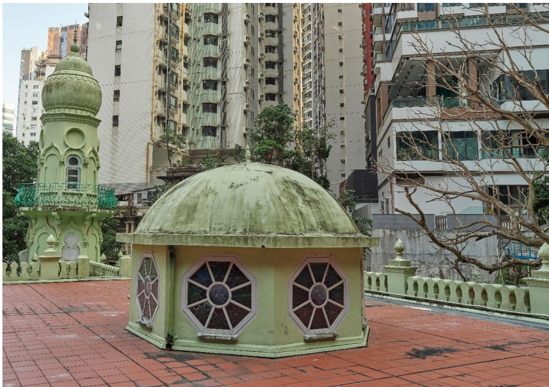
The octagonal dome with coloured glass windows at the centre of the prayer hall.