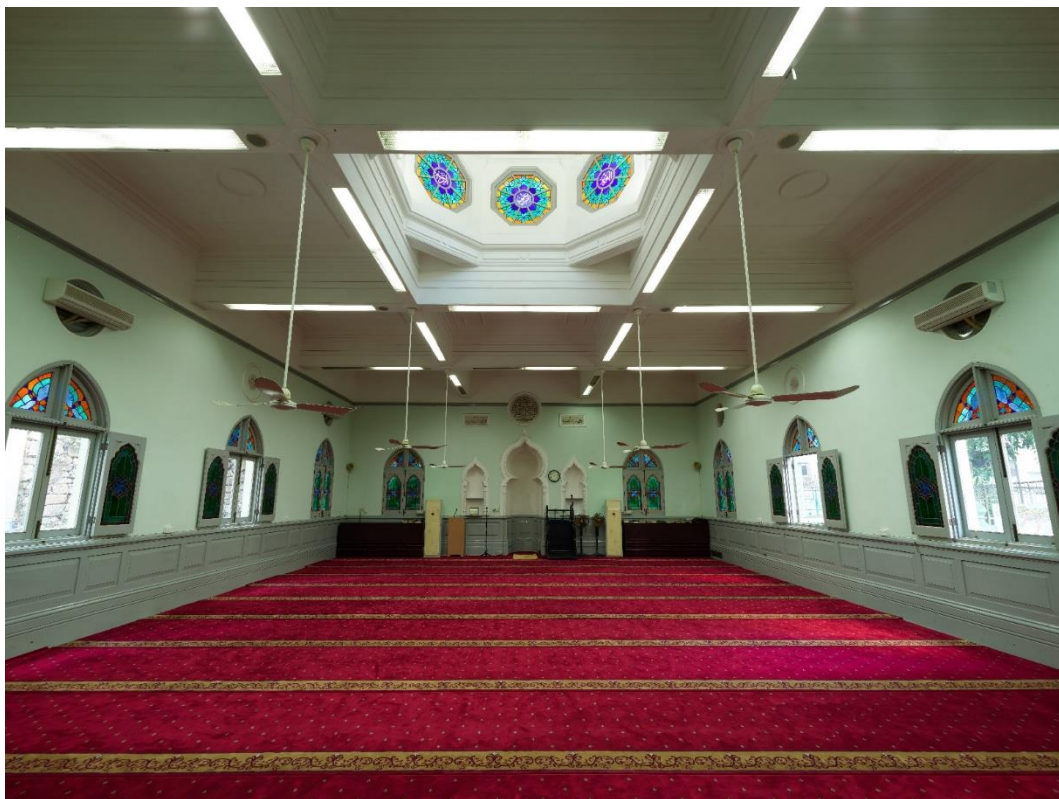
Interior of the prayer hall. Pointed arch windows with window leaves fitted with pointed multifoil coloured glazing are on both sides of the prayer hall.