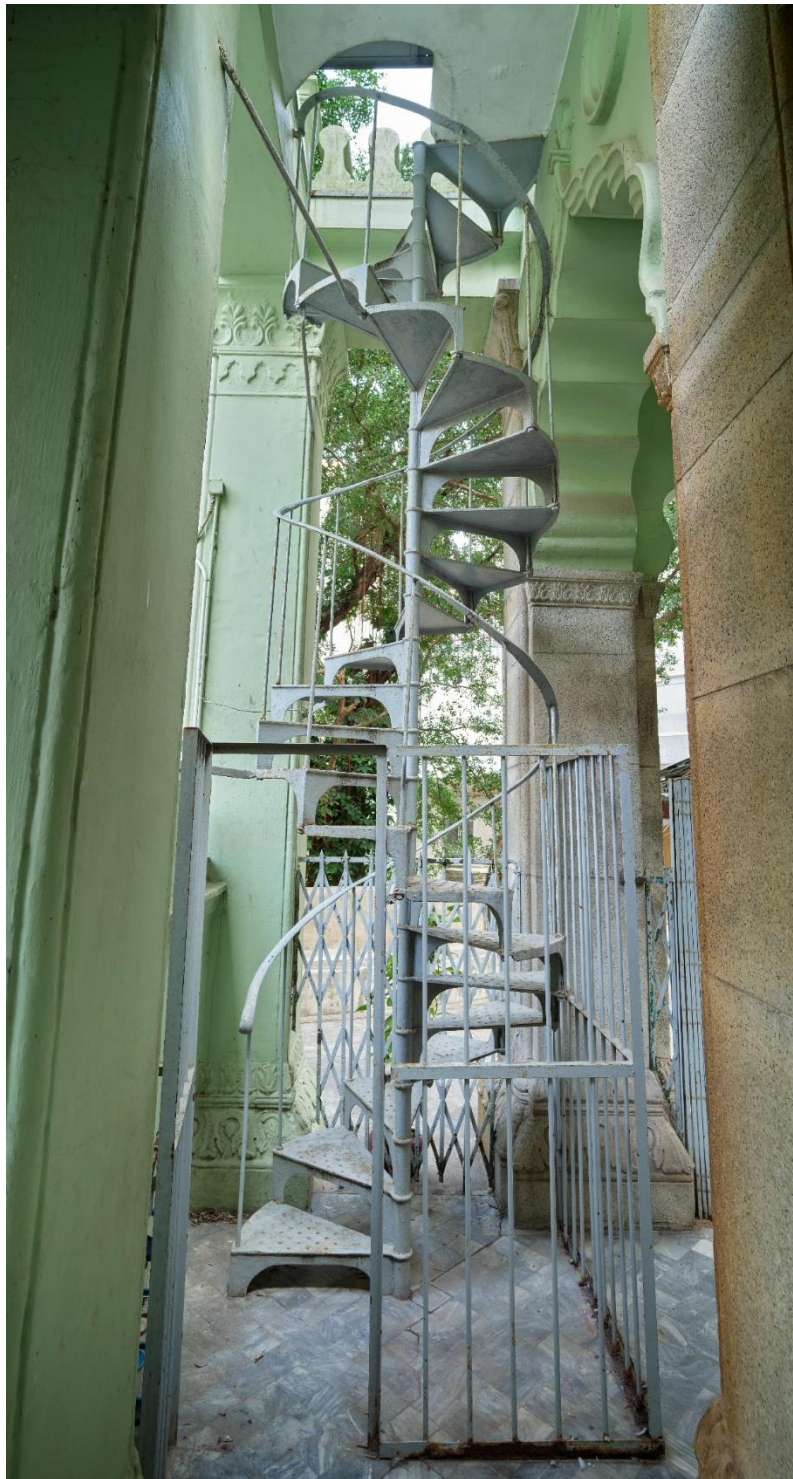
Metal spiral staircase at the corner of the entrance portico leading up to the minaret.