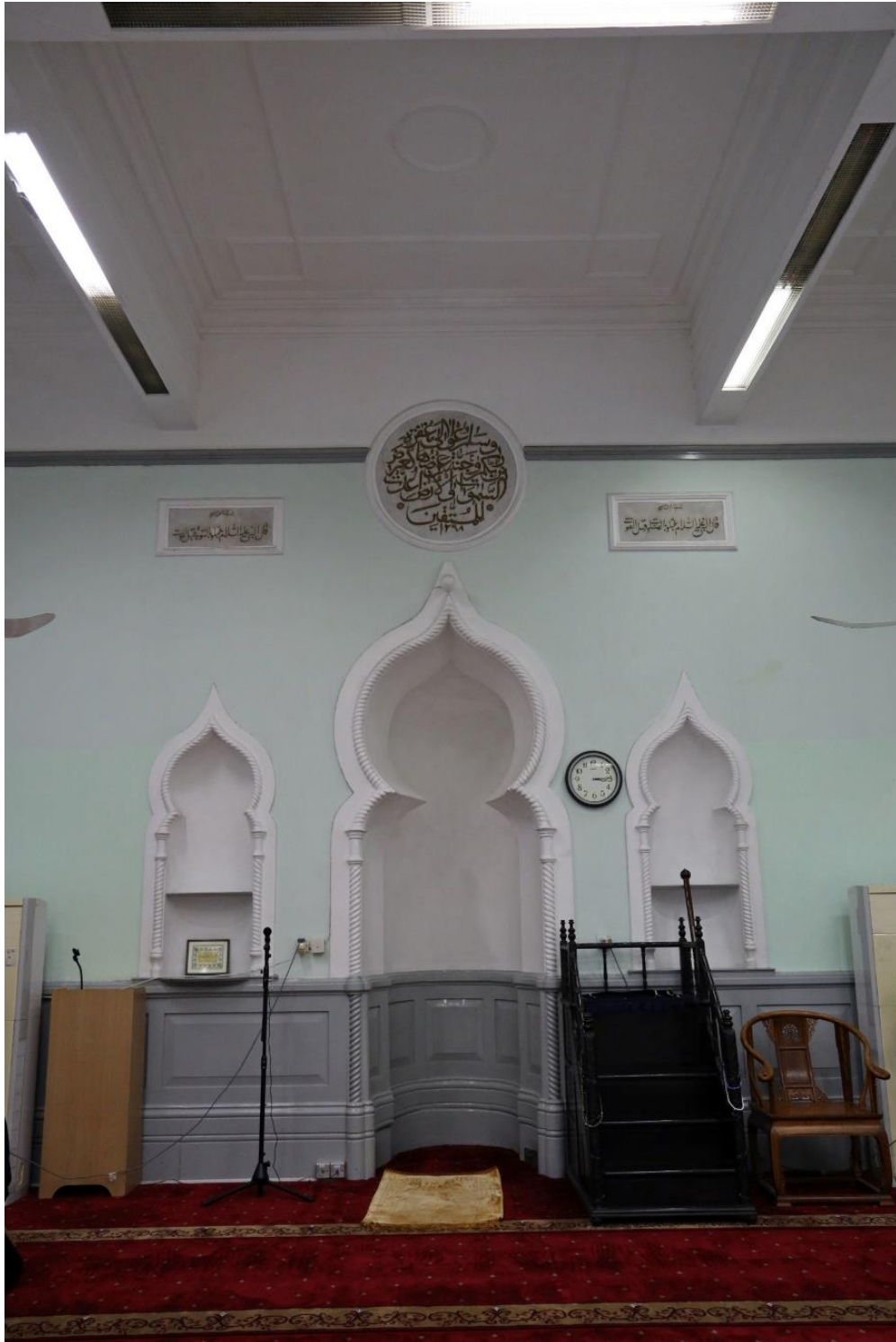
Mihrab with onion arch opening in the prayer hall. The century-old wooden mimber is placed by the side of the mihrab .