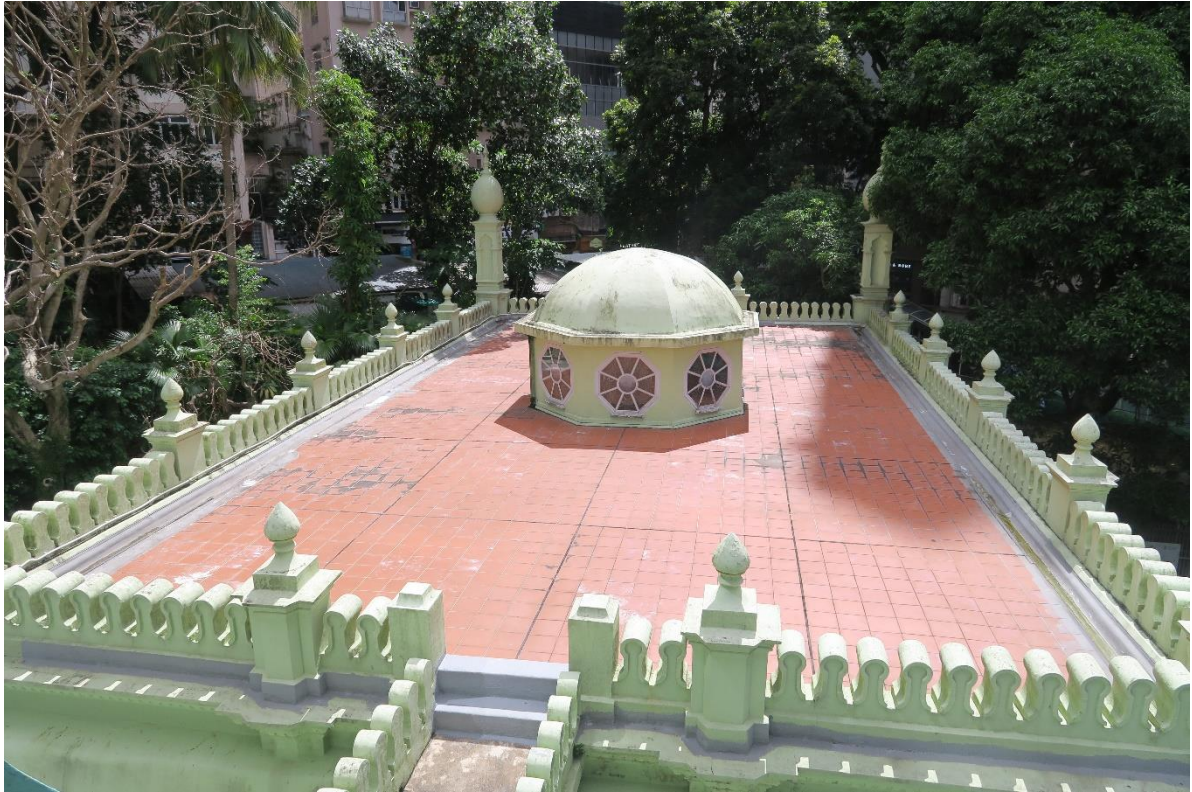
The roof parapets decorated by rounded merlons, with pedestals crowned by finial at intervals.