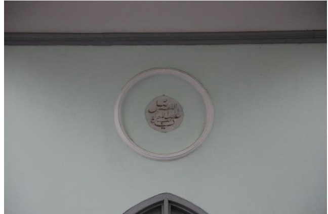
Kufic calligraphic motifs throughout the Jamia Mosque.