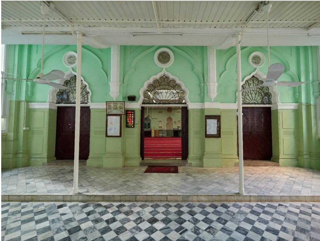
Three pointed multifoil archways at the entrance portico of the prayer hall. The floor of the entrance portico is finished with marble floor tiles .