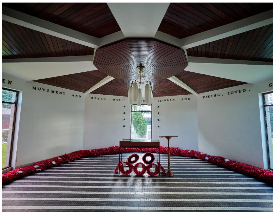
Interior of the Memorial Shrine.

Eight Chinese characters “英靈宛在 浩氣長存” are inscribed on the wall.