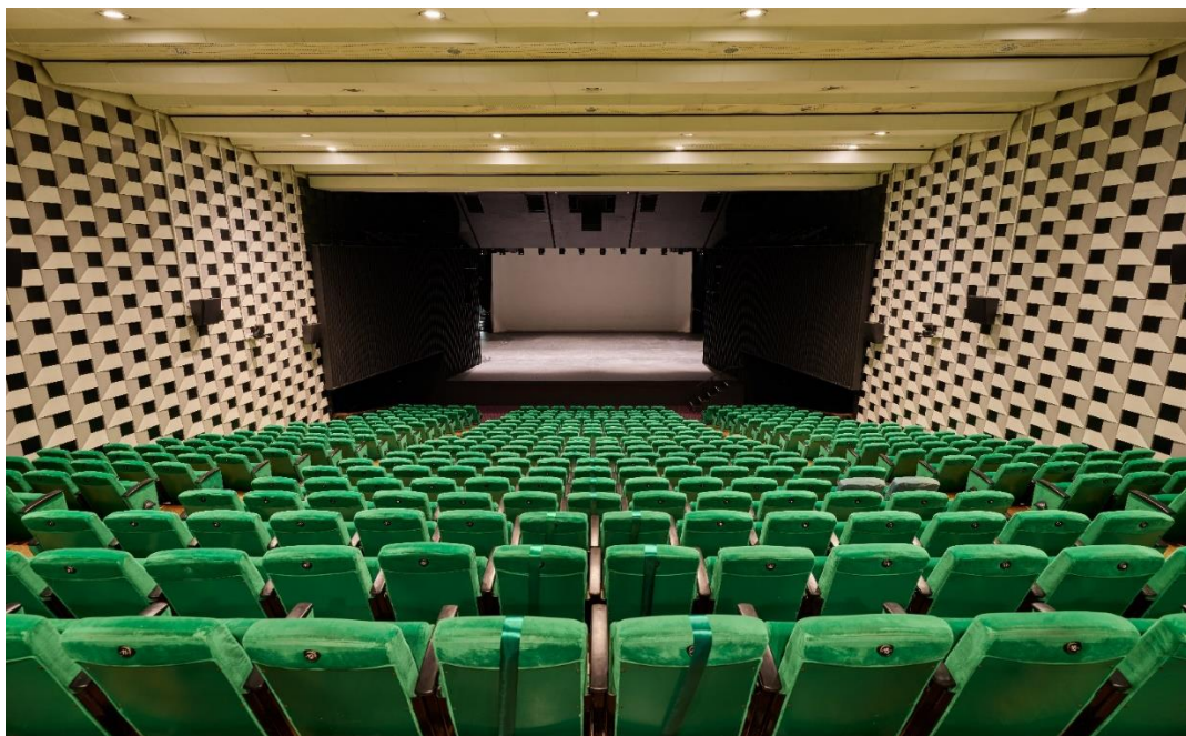
Theatre at Low Block.