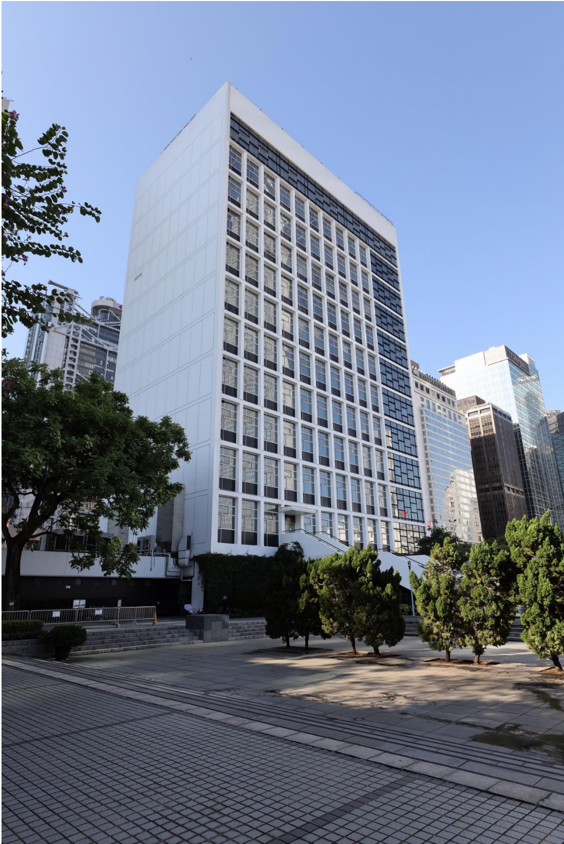
The north façade of High Block with “an uncomplicated repetitive fenestration in a concrete frame”; while the east façade is plastered white.