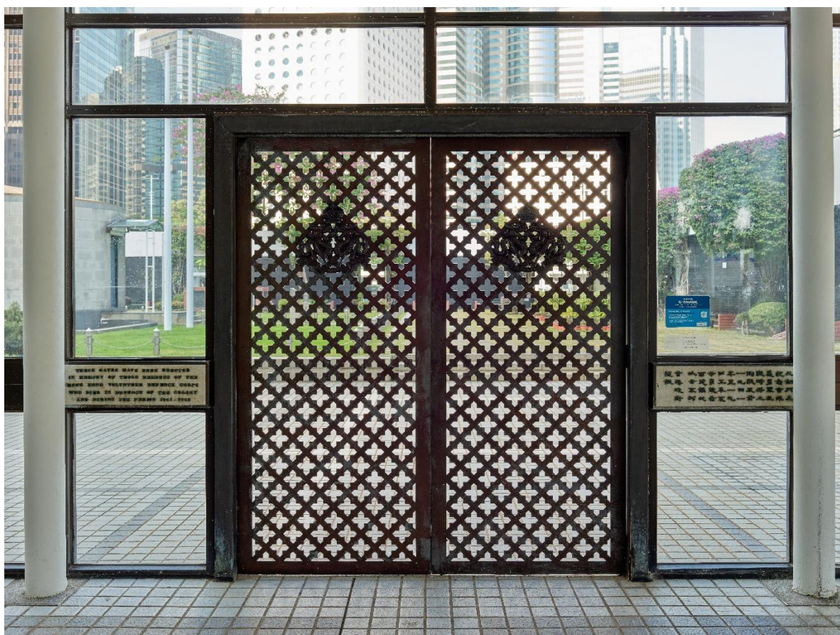
The copper gate at the entrance of Memorial Garden, carrying the emblem of the Hong Kong Volunteer Defence Corps.