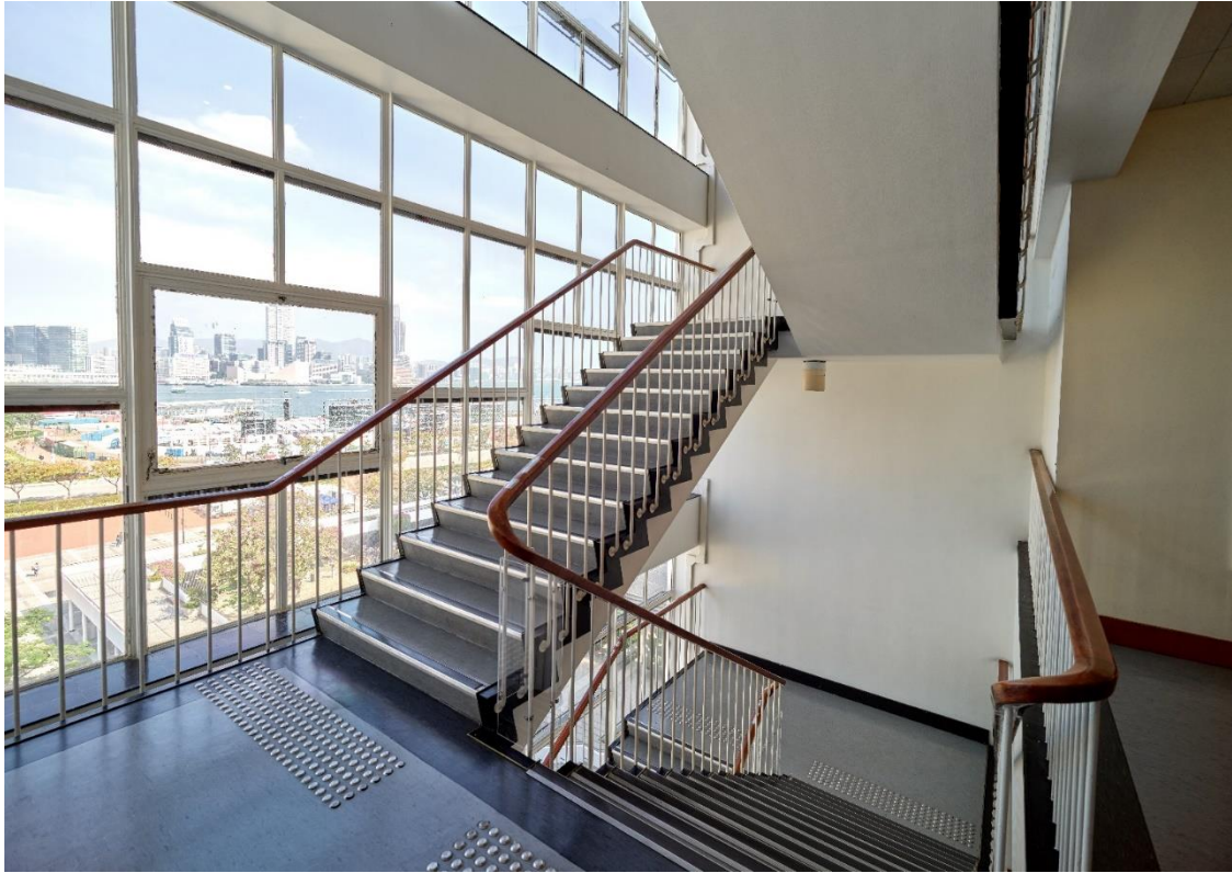
Staircase in High Block overlooking the sea view of Victoria Harbour through its big windows.