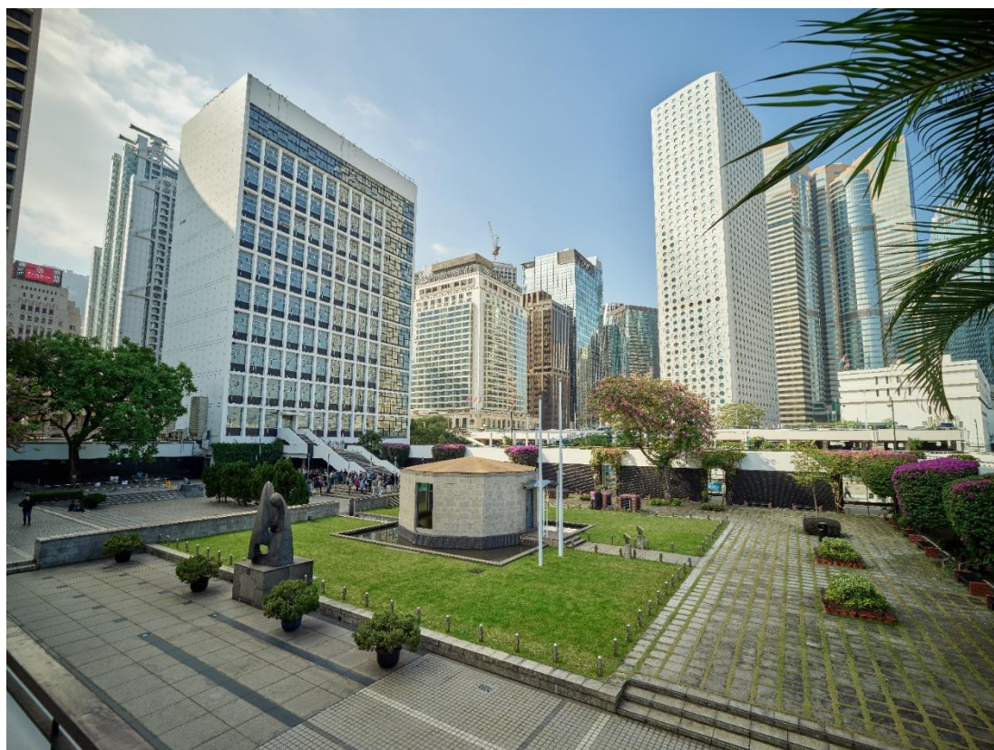
A 12-sided Memorial Shrine at the centre of Memorial Garden.