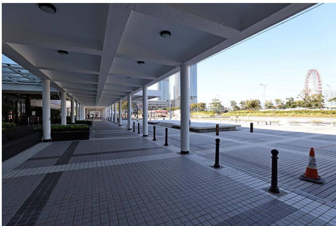
A covered walkway connecting Low Block, Memorial Garden and High Block.