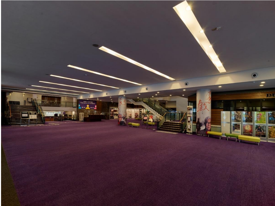
Foyer of Low Block serving as a crush room for intermission of performances at Concert Hall or Theatre.