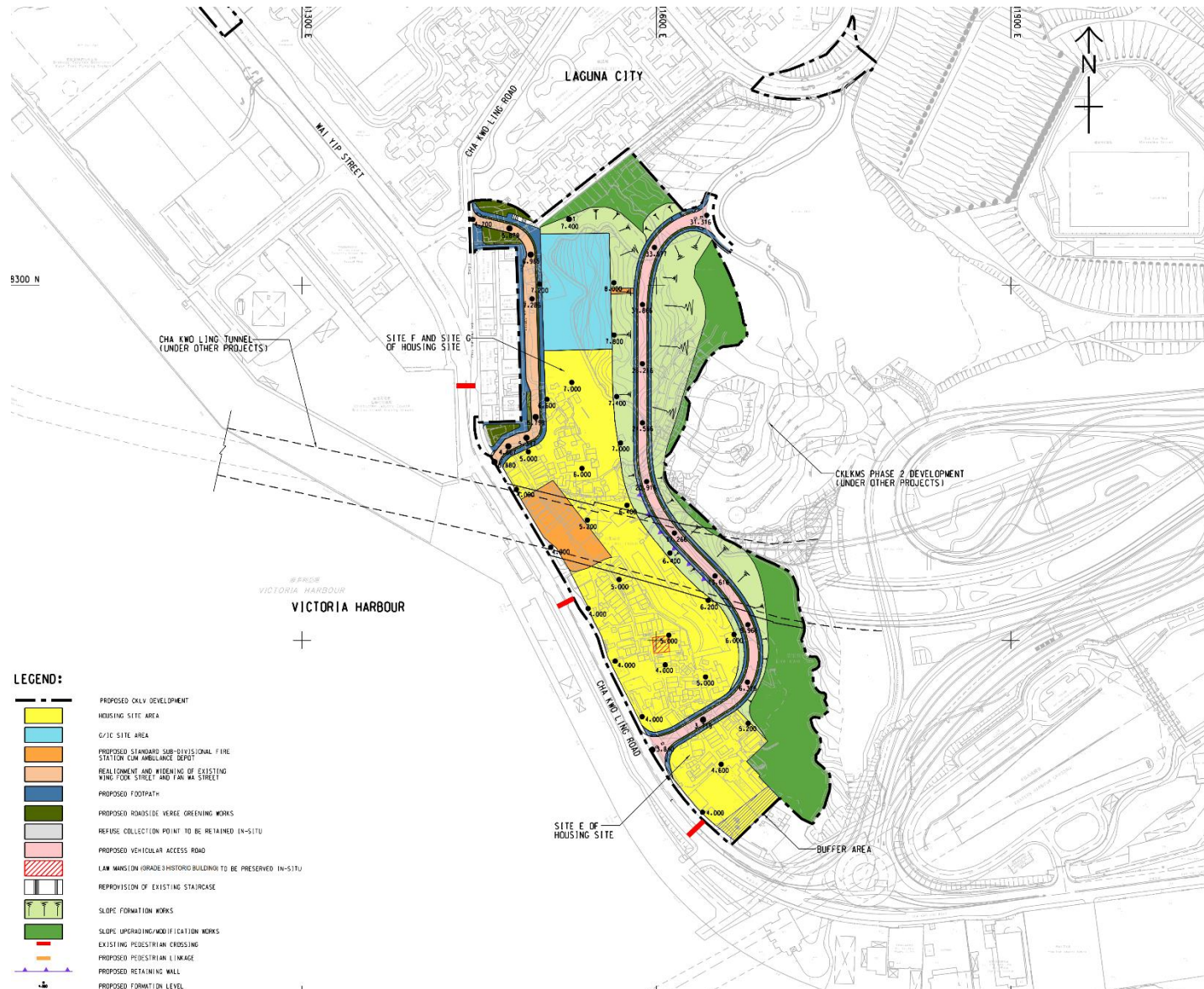
Figure1 Proposed Layout Plan for CKLV Development