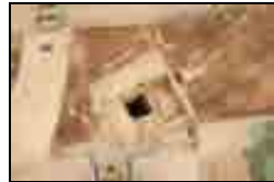
J5井 Well J5 (宋、元時期 Song-Yuan Period)