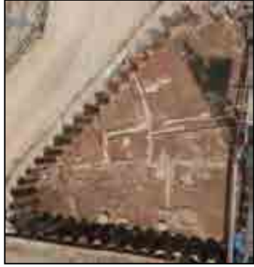
石砌建築遺蹟 Stone building features (宋、元時期 Song-Yuan Period)