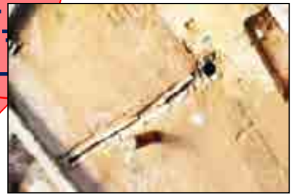
J2井 Well J2 (宋、元時期 Song-Yuan Period) 引水槽 Water channel (二十世紀初期 Early 20 th Century)