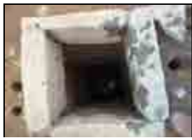
J1井 Well J1 (宋、元時期 Song-Yuan Period)