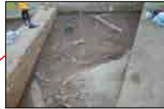
石砌建築遺蹟 Stone building features (宋、元時期 Song-Yuan Period)