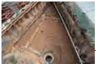
石砌建築遺蹟 (宋、元時期) 及J3井 (晚清時期) Stone building features (Song-Yuan Period) and Well J3 (Late Qing Period)