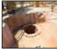
紅磚井 Red Brick Well (近代 Modern)