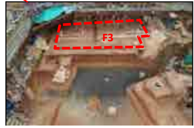
殘存房屋構件 Building remains (宋、元時期 Song-Yuan Period)