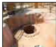
紅磚井 Red Brick Well (記錄方式保存 Preserve by record )