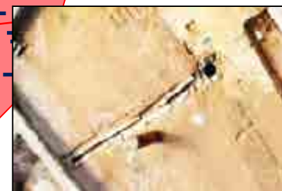
J2井和引水槽 Well J2 and water channel (四個保育方案 4 Conservation options )