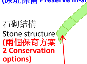
石砌結構 Stone structure (兩個保育方案 2 Conservation options )