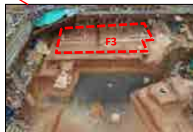
殘存房屋構件 Building remains (原址保留 Preserve in-situ )