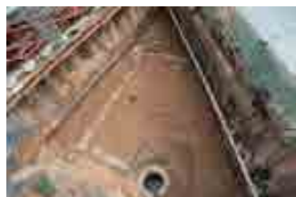
石砌建築遺蹟及J3井 Stone building features and Well J3 (原址保留 Preserve in-situ )