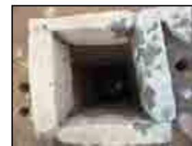
J1井 Well J1 (原址保留 Preserve in-situ )