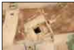
J5井 Well J5 (原址保留 Preserve in-situ )