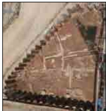
石砌建築遺蹟 Stone building features (原址保留 Preserve in-situ )