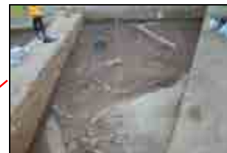
石砌建築遺蹟 Stone building features (原址保留 Preserve in-situ )