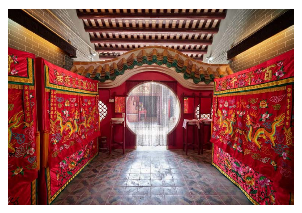
Residential chamber of Tin Hau at the subsidiary building