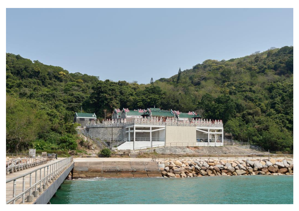
The sea-facing setting is the most distinctive feature of Tin Hau Temple, Joss House Bay.