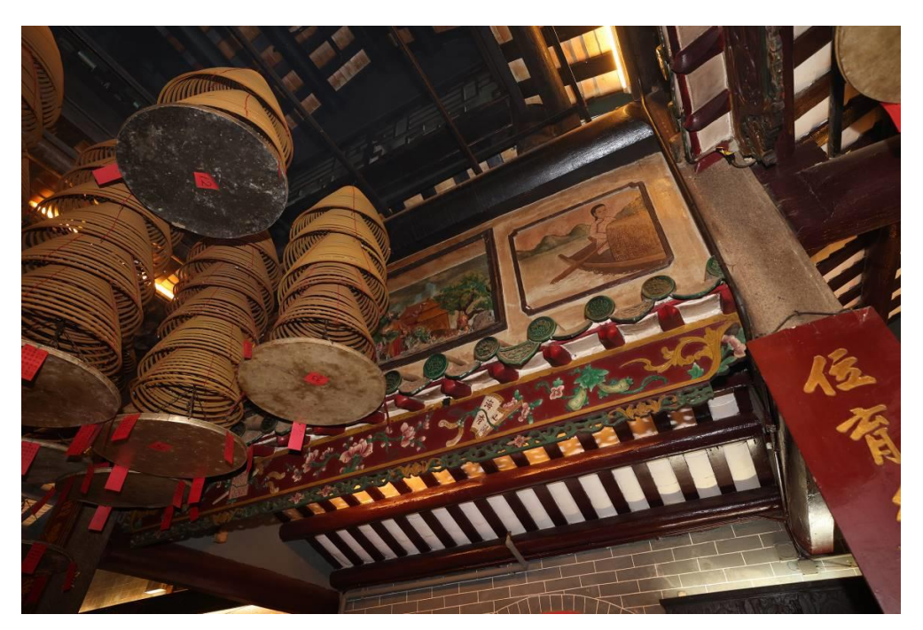
Decorative fascia board, murals and mouldings of animal and human figurines at the incense pavilion