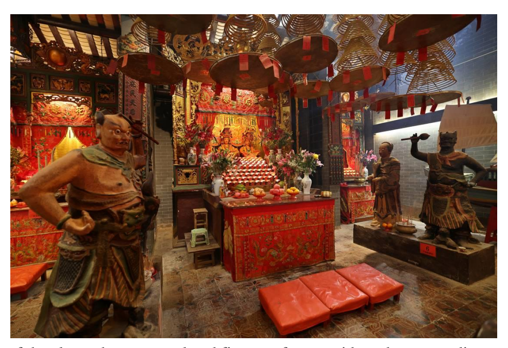
In front of the altars, there are sculpted figures of two maids and two guardian assistants, the Thousand League Eyes (right) and Wind-Flavouring Ears (left).