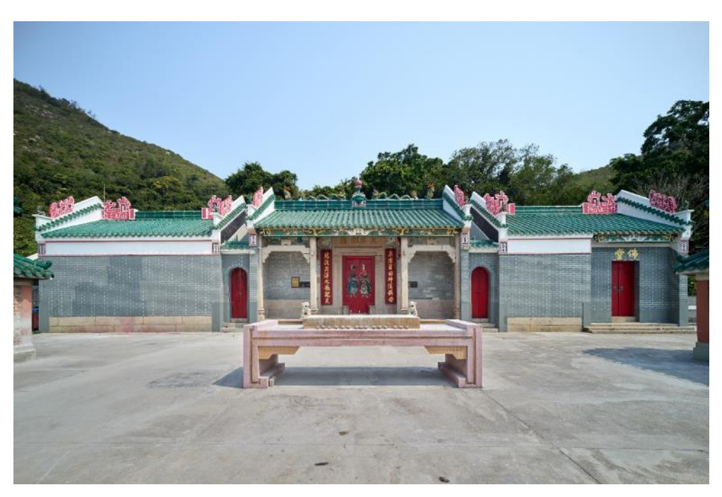
The front façade of Tin Hau Temple, Joss House Bay