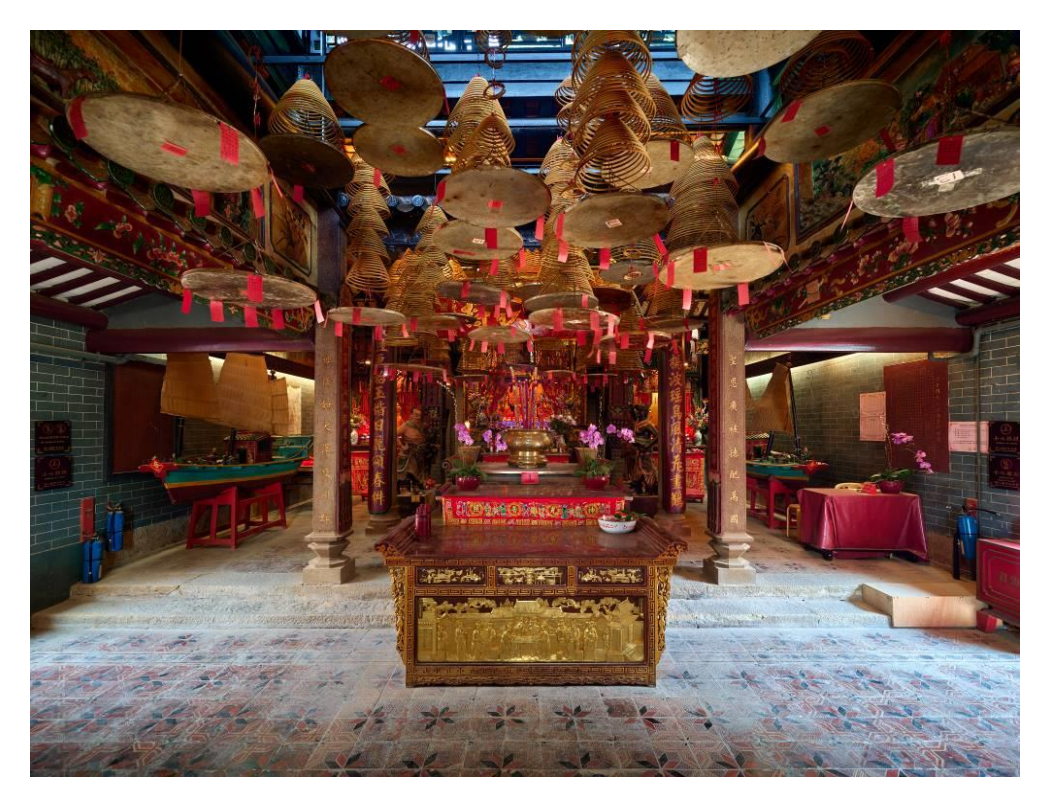
The main building is a two-hall structure. An incense pavilion is built between the two halls.