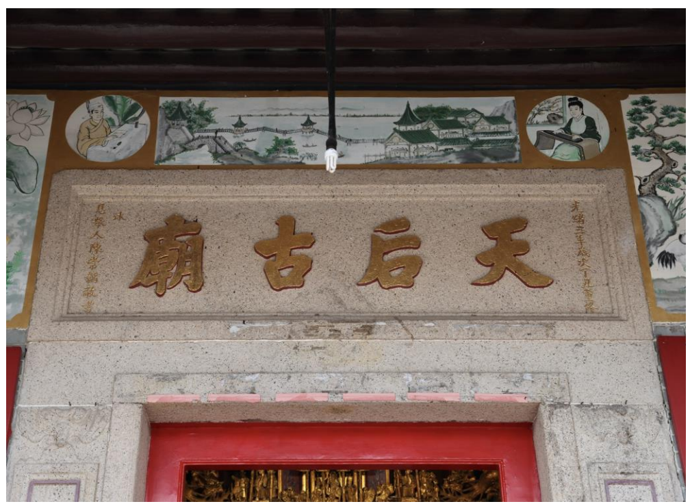
The granite lintel dated 1877 at the main entrance of Tin Hau Temple, Joss House Bay