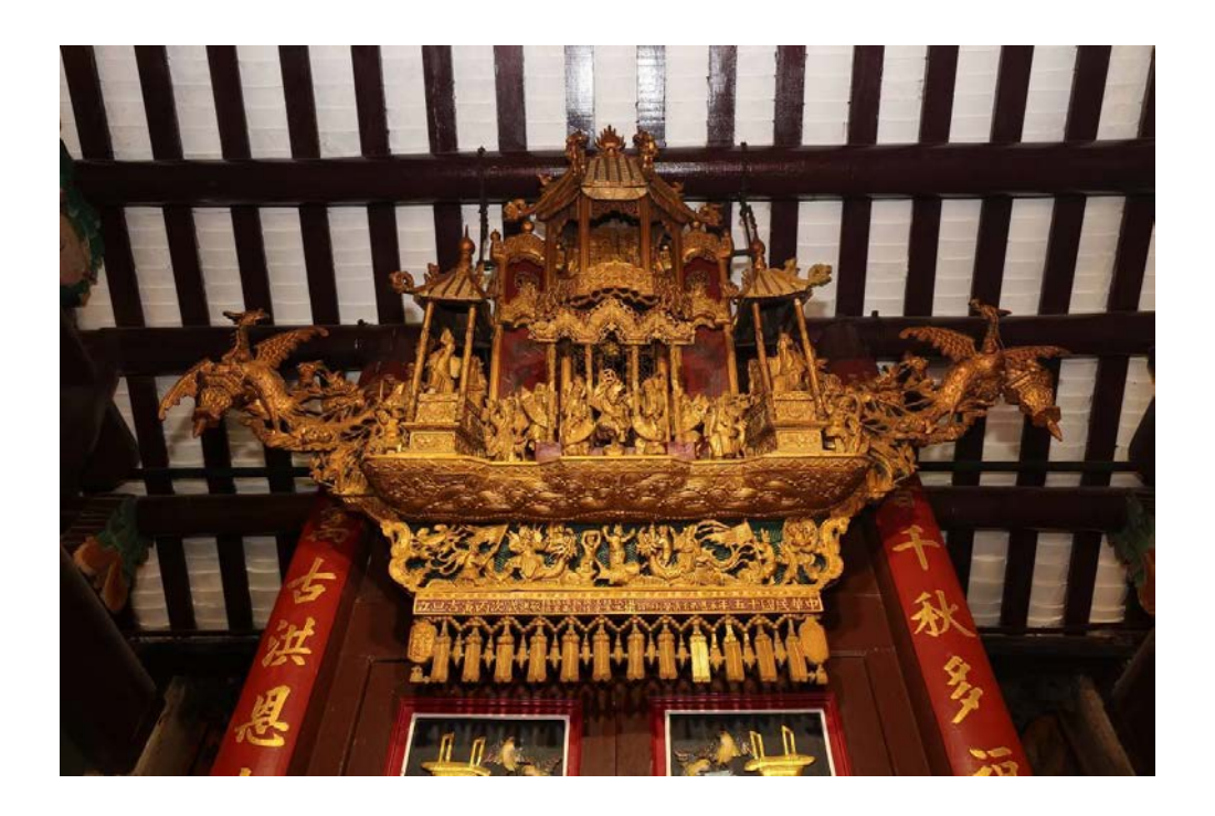
The boat-shaped wooden panel dated 1925 above the screen doors in the entrance hall