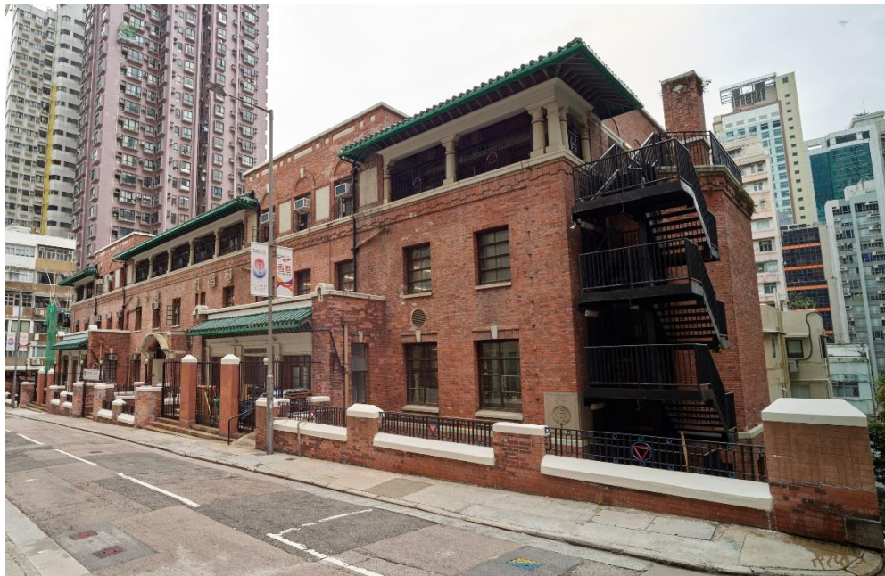
Tuscan columns and green glazed tiled eaves at the front elevation of the Central Building