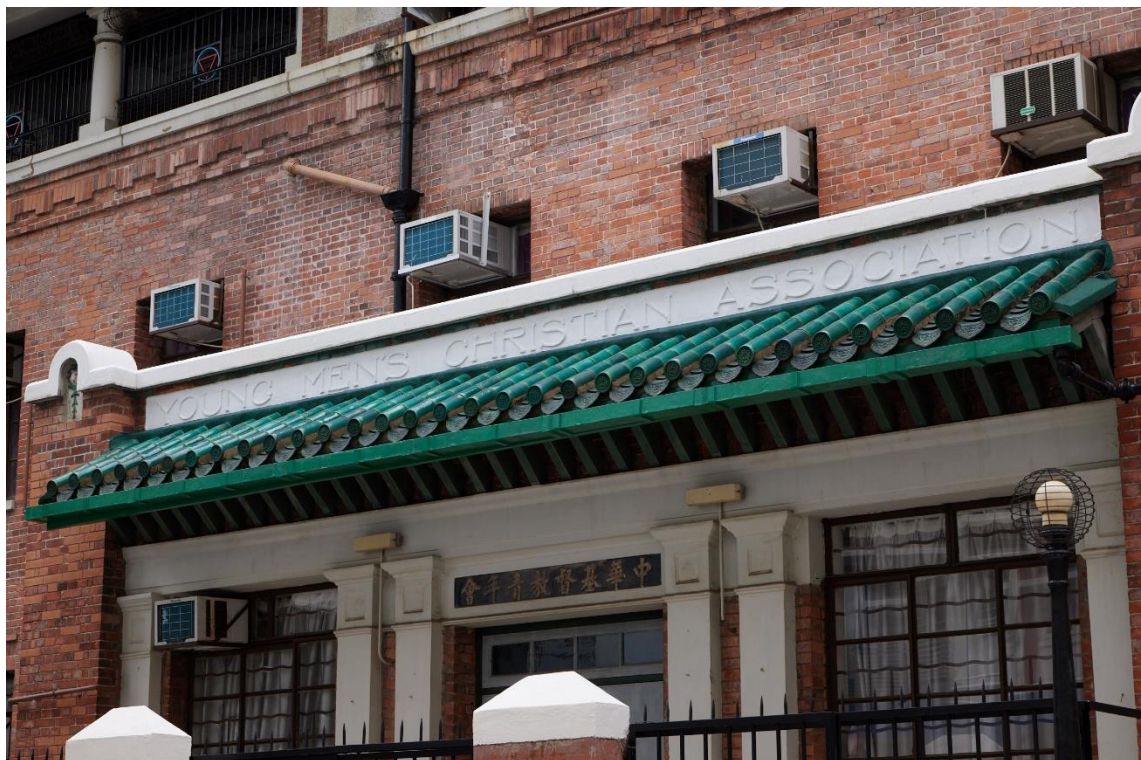
The inscription of “Young Men’s Christian Association” above the entrance porch near Tank Lane