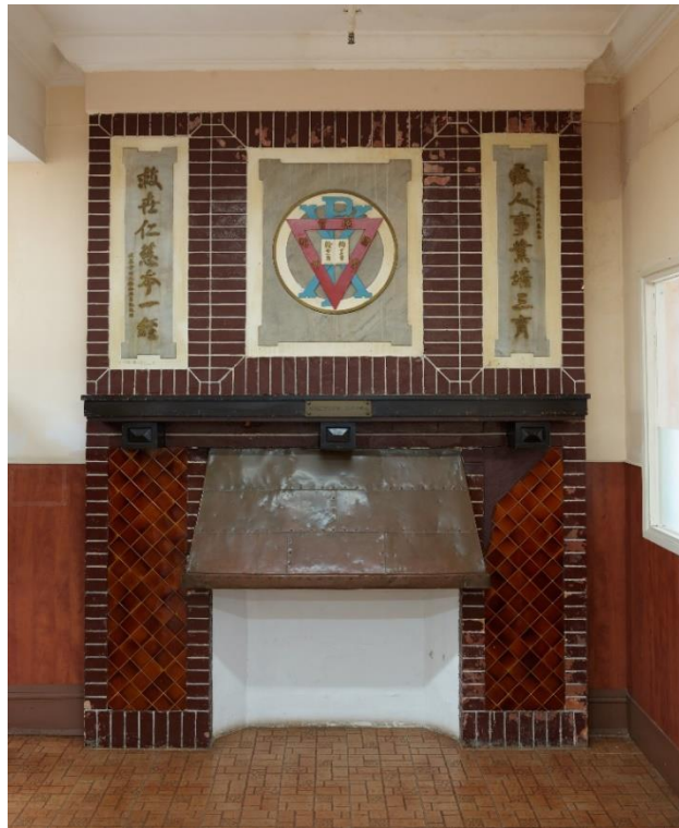
The fireplace on ground floor.

The emblem of YMCA and couplets backed with marble plate and slabs are on top of the mantle.