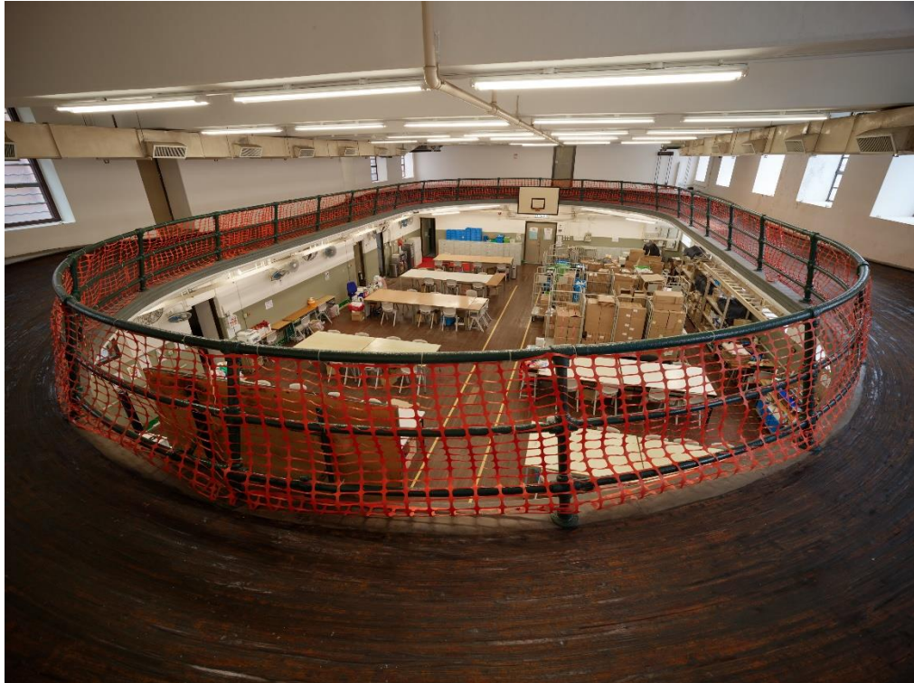
The gymnasium with a wok-shaped timber running track