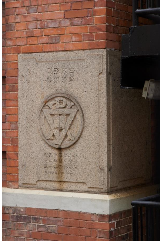
The foundation stone at the front elevation of the Central Building