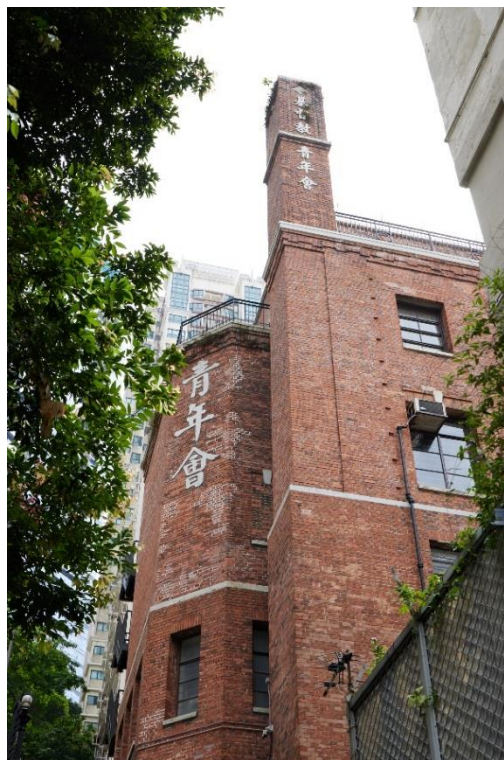
The side and rear elevations of the Central Building looking from Ladder Street. The Chinese name of YMCA are installed at prominent positions.