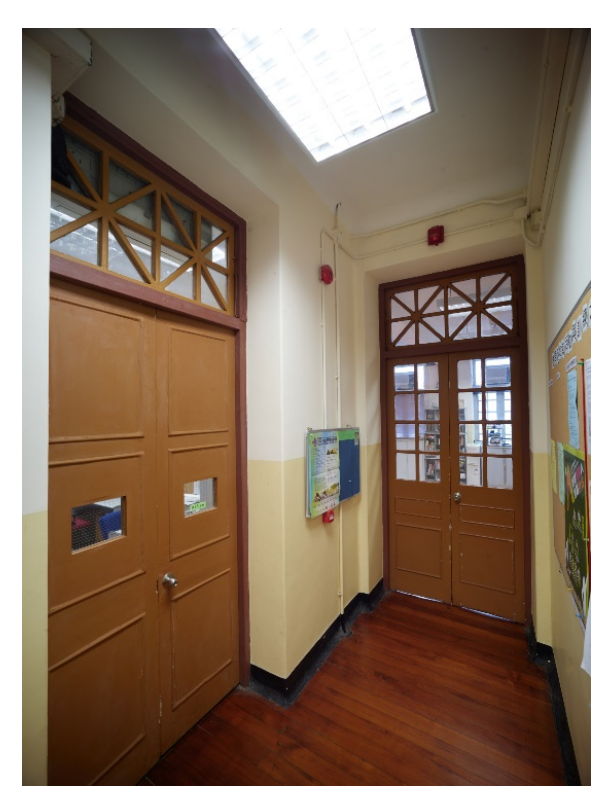
Timber panel doors with transom windows