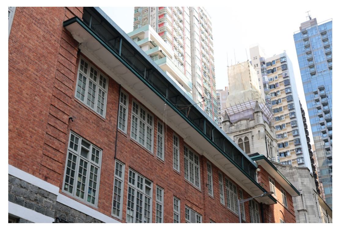
The projecting canopy decorated with a dentil cornice and alternate square and circle-shaped motifs on the soffit