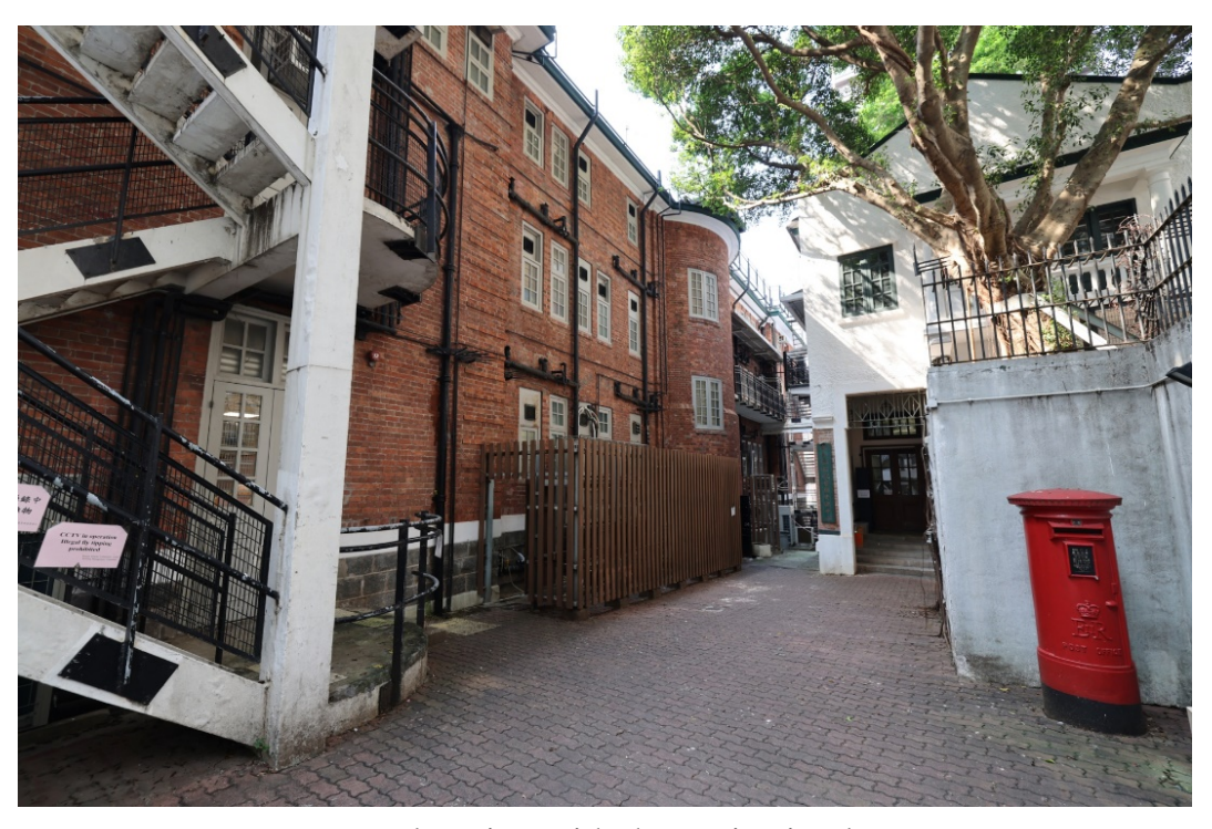
Rear elevation with the projecting bay