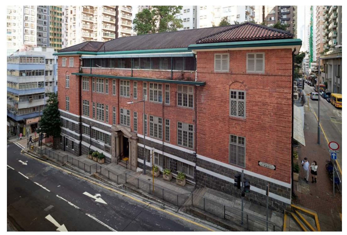
Hip and valley roof laying with double-layered pan-and-roll tiles