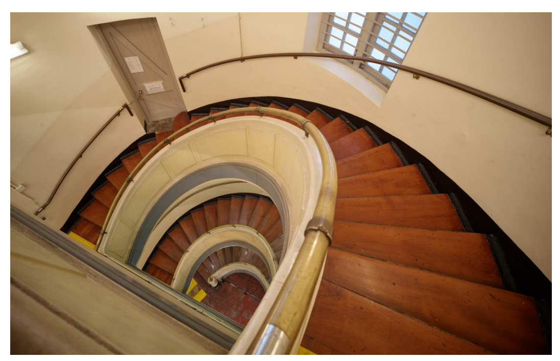
Spiral staircase with a solid concrete balustrade and metal handrails