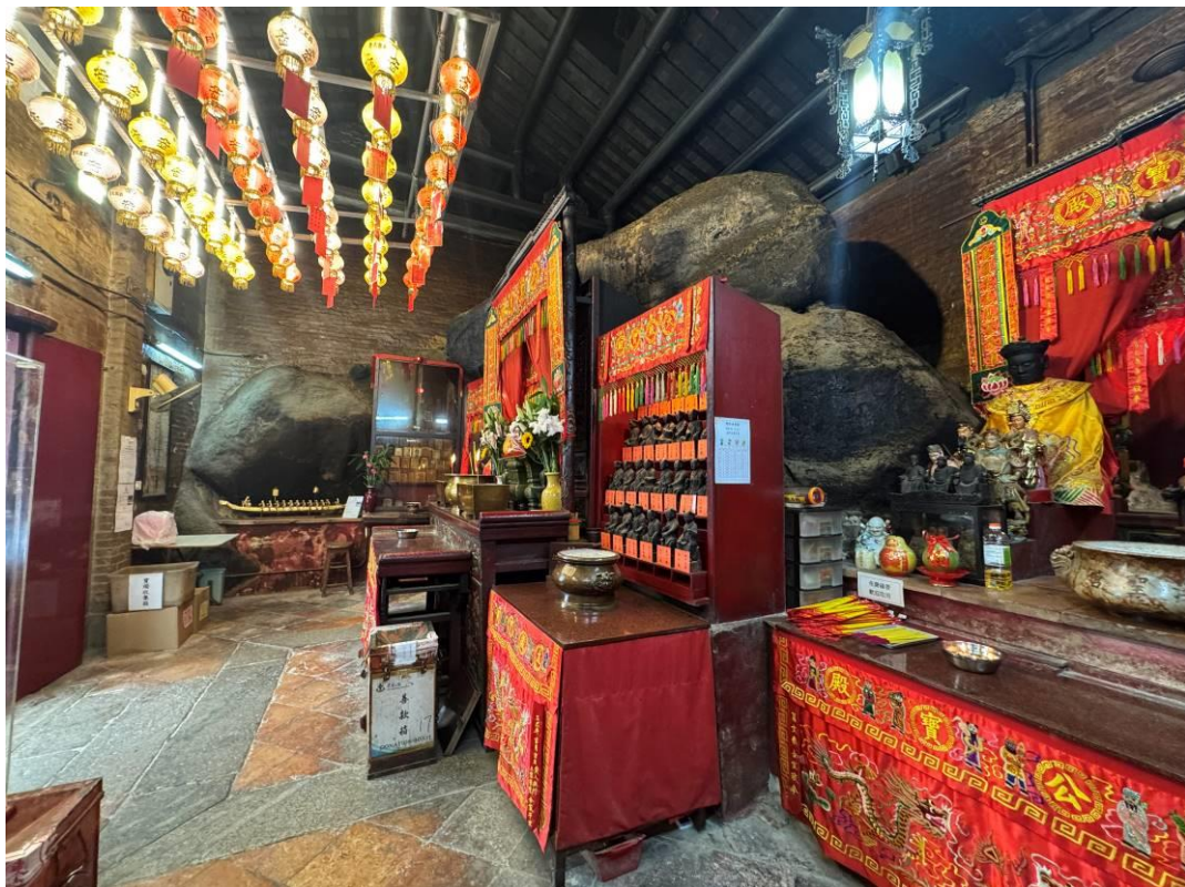
The eastern and rear elevations of the temple hall integrate seamlessly with the natural rock formations.