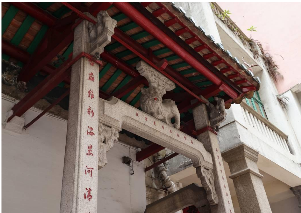
Square granite columns connected by “prawn beam” (蝦弓樑) (prawn-shaped tie beam) that features finely carved granite geja (隔架).