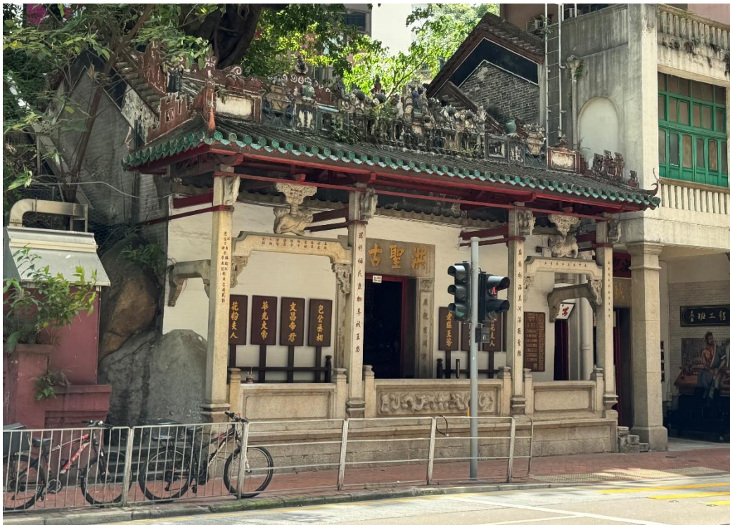
Front elevation of Hung Shing Temple