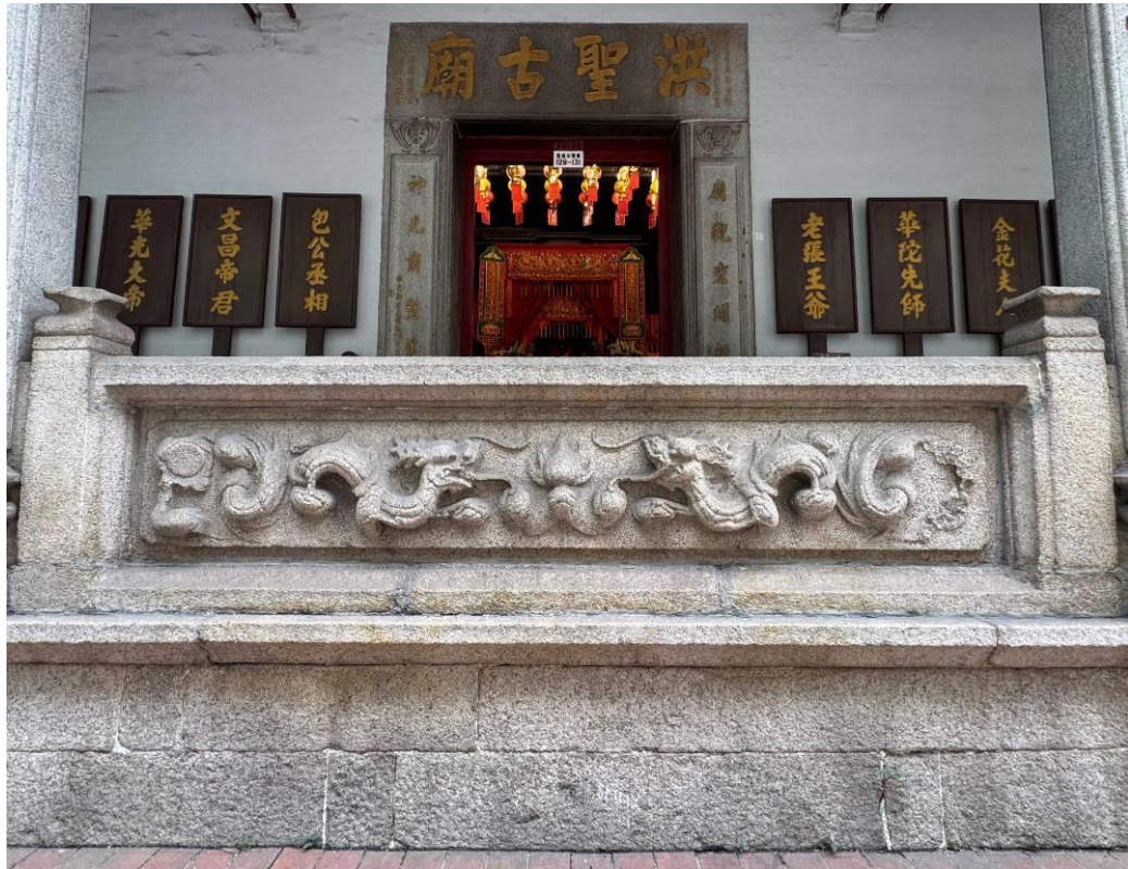
The central granite balustrade of the entrance porch intricately carved with a motif of double dragons and a pearl (雙龍戲珠).