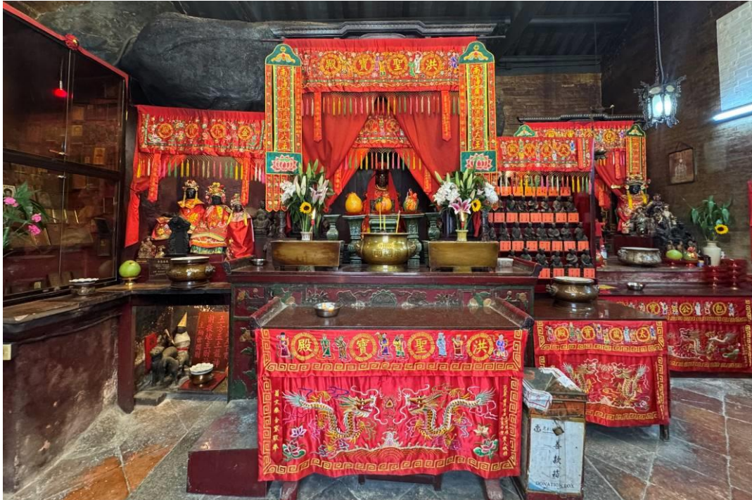
The main altar dedicated to Hung Shing is flanked by other deities, including Tai Sui (太歲), Pau Kung (包公), Lady Kam Fa (金花夫人) and Lady Fa Fan (花粉夫人).