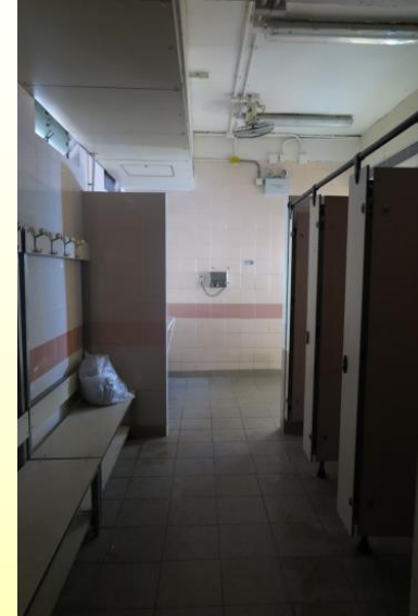
Female Toilet (left) and Bathroom (right)