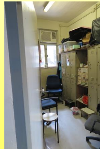
Former Caretaker's Quarters and Pump Room