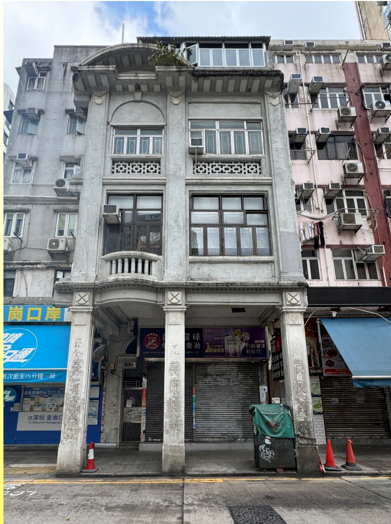
正立面 Front elevation